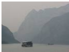
Three Gorges Dam Reservoir

It is not just the waters downstream from the Three Gorges Dam that are suffering. The dam's reservoir itself is slowly, but inexorably, turning into a toxic, turbid stew as it traps more and more pollutants, sewage and garbage behind its "Great Wall" [1].