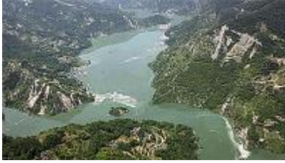
Quake lake bird's eye view

In fact, China is no stranger to such dam disasters. Exhibit A for such a problem is the Banqiao Dam, which was originally built in the early 1950s. When cracks were found in the dam and its sluices, they were dutifully repaired and reinforced by Soviet engineers, after which the Banqiao was dubbed the “iron dam.” Like the Titanic, it was supposed to be indestructible. Then, in 1975, Typhoon Nina hit.