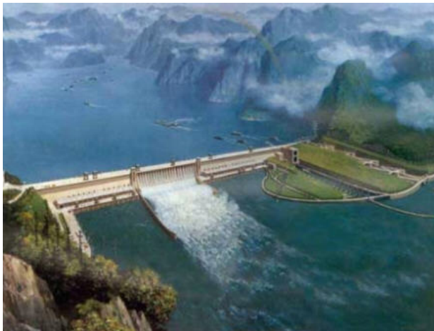
The Three Gorges Dam

China's "Great Wall on the Yangtze" stands more than 600 feet tall, is almost 400 feet wide at the bottom, and stretches almost a mile and a half across the river. What is most impressive, and potentially most dangerous, about the dam is not its height and width, but rather the mammoth reservoir that the dam has created. This is a reservoir that is 400 miles long and 70 miles wide and holds five trillion gallons of water—equal to one-fifth of all the freshwater consumed in the United States annually.