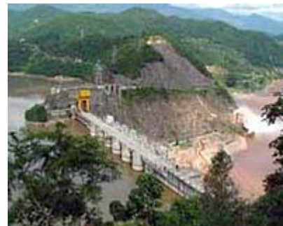
The Manwan Dam

China's grand Mekong River design will eventually include 15 large dams. The first two, the Manwan and Dachaoshan, were completed in 1993 and 2002, respectively. Together, they generate close to 3,000 megawatts of electricity—equivalent in output to about three large nuclear reactors.