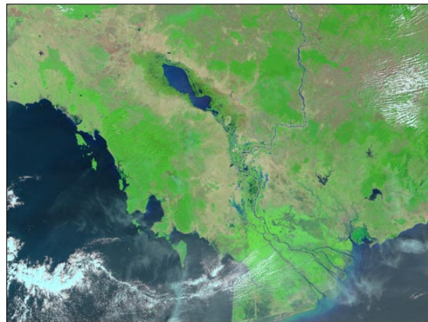
Dry Season (January 29, 2003)