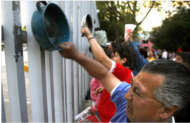
Mexican food protest

tariffs, state regulations and government support institutions, which neoliberal doctrine identified as barriers to economic efficiency.