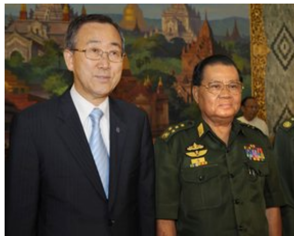
Ban Ki-moon and Than Shwe

politically destabilizing and they would be able to report to the outside world on conditions inside the country. As a result, the very small number of foreign journalists in the country (the authorities have been attempting to locate and deport them) and Burmese witnesses say that the government's relief efforts have been grossly inadequate, given the scale of the catastrophe. Observers generally agree that only about a quarter of the worst affected population in the disaster area has received aid. As of this writing (May 26, 2008), it is unclear whether Senior General Than Shwe's promise to United Nations Secretary General Ban Ki Moon on May 23 that "all" aid supplies and aid experts from foreign civilian sources would be accepted represents a genuine change of heart or is merely a tactic to hold the international community at bay while the military regime seeks to reassert full control over the Irrawaddy Delta.