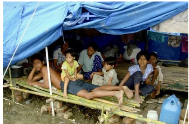
Survivors of the cyclone

Fatalities are likely to rise both because of the extremely unsanitary conditions in the disaster area, and the slowness of the State Peace and Development Council (SPDC), the Burmese military government, in getting assistance where it is most needed.