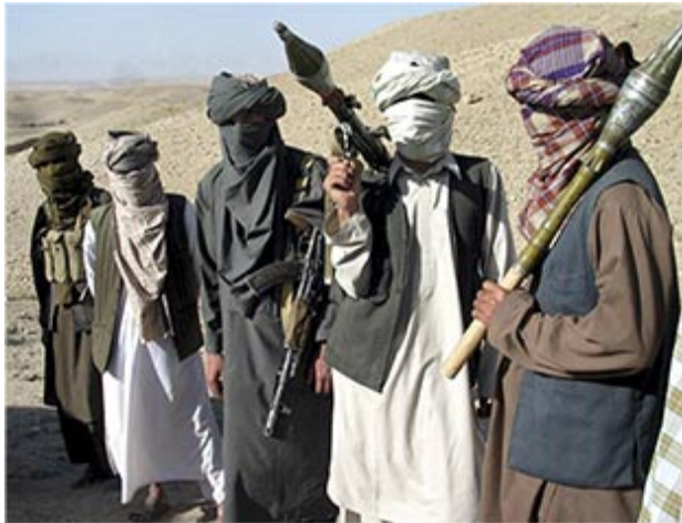
Taliban forces in Afghanistan

Sunday Times, 13 April 2008). The human costs of this carnage are grave enough, but leaving that aside it might be assumed that the figure is regarded as a sign of military success. Not so: the story reflects an intelligent recognition that deaths on this scale "are a boost for the Taliban when fighters recruited from the local population are killed, as the dead insurgent's family then feels a debt of honour to take up arms against British soldiers." The assessment, put bluntly, is that killing Taliban makes even more enemies.