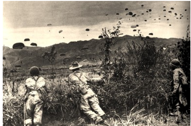
French airborne assault to defend Dien Bien Phu

the resources to supply Dien Bien Phu by air; the Vietminh controlled the access routes, and mounted an epic effort to transfer supplies (a huge amount of them by bicycle) across densely forested and mountainous tracks to encircle and besiege the French forces.