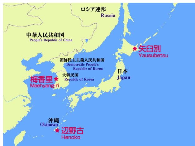
Locations of Yausubetsu, Henoko and Maehyang-ri