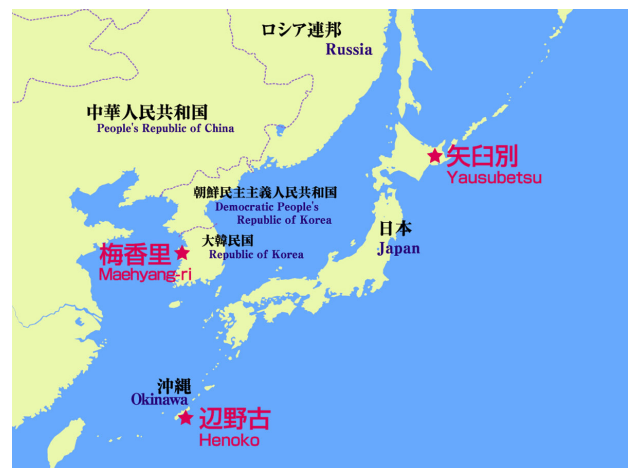
Locations of Yausubetsu, Henoko and Maehyang-ri