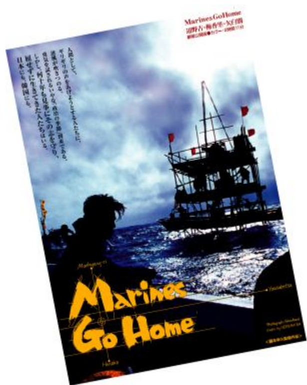
Publicity Poster for Marines Go Home

the Henoko project is ongoing in 2008. [6]