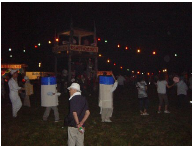
Photo of Heiwa Bon-odori