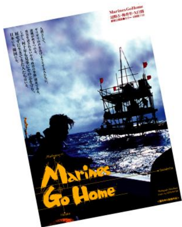
Publicity Poster for Marines Go Home

the Henoko project is ongoing in 2008. [6]