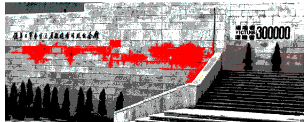
Nanjing Memorial Museum with figure of 300,000 deaths

atrocities. Many have also supported reparations for victims.