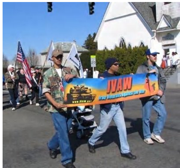
IVAW prepare for Winter Soldier 2008

On March 13-16, 2008 a second Winter Soldier gathering took place in Washington DC, with hundreds of Iraq War veterans providing testimony, photographs and videos documenting brutality, torture and murder in cases such as the Haditha Massacre and the Abu Ghraib torture. [36] As in the first Winter Soldier, the mainstream media ignored the event organized by Iraq Veterans Against War. Again, however, the voices of these veterans have reached out to some through films and new electronic and broadcast media such as YouTube.