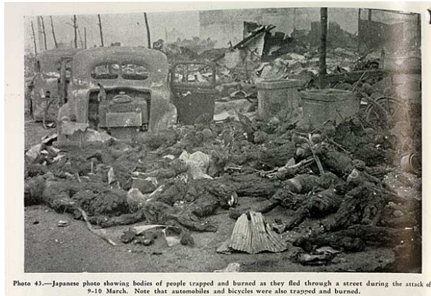
Photo 43.—Japanese photo showing bodies of people trapped and burned as they fled through a street during the attack of 9-10 March. Note that automobiles and bicycles were also trapped and burned.

conditions, and survivors' accounts. [18] An estimated 1.5 million people lived in the burned out areas. Given a near total inability to fight fires of the magnitude and speed produced by the bombs, casualties could have been several times higher than these estimates. The figure of 100,000 deaths in Tokyo may be compared with total US casualties in the four years of the Pacific War—103,000—and Japanese war casualties of more than three million.