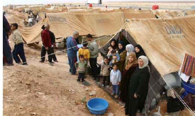
Iraqi refugees on the Syrian border

election. It is of course a region in which the geopolitical stakes far exceed those in Korea or Vietnam.