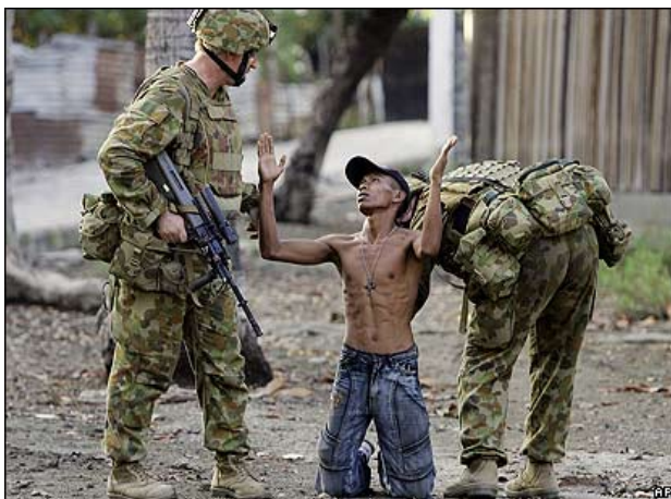
Australian peace keepers in action in East Timor

be noted that the original “request” came from Canberra, not Dili. Portugal subsequently sent a police detachment, the Guarda Nacional da Republica, (GNR) operating under its own mandate. With the arrival of an advance party of 150 Australian commandos on 25 May, the rules of engagement were hastily drawn up at a meeting at Dili airport involving the Australian Military Commander, the RDTL Foreign Minister, and the Special Representative of the Secretary-General (SRSG). On 26 May, the RDTL government handed over responsibility for security in Dili to Australian troops. It should be noted that Operation Astute – as it was known – did not operate under UN control, nor was it mandated by any Security Council resolution. The model would be that of the Australian-led mission in the Solomon Islands or RAMSI.