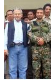
Ramos-Horta (left) and Reinado

Concerning the events of 23 May, Major Alfredo Reinado and his men were deemed “reasonably suspected” of committing crimes against life during an armed confrontation near Dili. [Reinado was the self-proclaimed leader of a breakaway F-FDTL or “petitioner” group and major cause of instability inside East Timor until his demise on 11 February 2008 in the still mysterious assassination attempt against Jose Ramos-Horta.] In this regard, the then President (Xanana Gusmao) “should have shown more restraint and respect for institutional channels in communicating directly with Major Reinado after his desertion.”