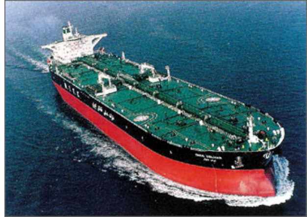
China-built oil tanker for Iran

"Iran's growth of power in the region and the international arena is to Beijing's interest," he stated.