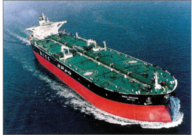
China-built oil tanker for Iran

"Iran's growth of power in the region and the international arena is to Beijing's interest," he stated.