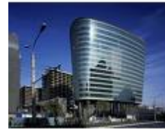
CNOOC in Beijing

Developments like this create an atmosphere of anxiety, impatience, and unslaked greed—elements not conducive to an effective sanctions regime—among Western oil companies.