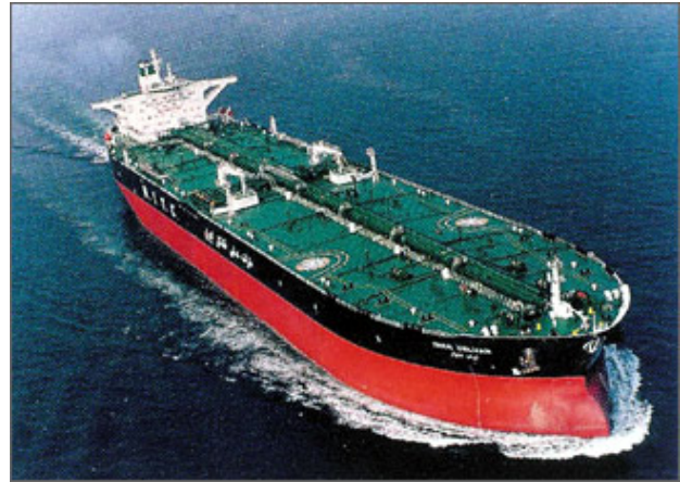
China-built oil tanker for Iran

"Iran's growth of power in the region and the international arena is to Beijing's interest," he stated.