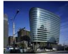
CNOOC in Beijing

Developments like this create an atmosphere of anxiety, impatience, and unslaked greed—elements not conducive to an effective sanctions regime—among Western oil companies.