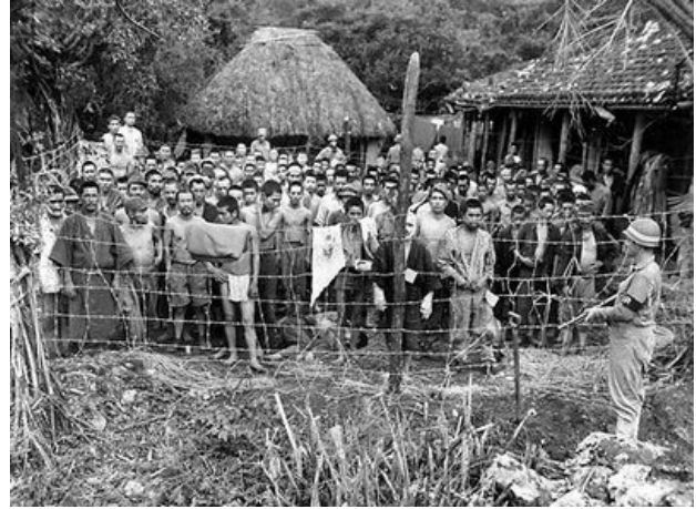
Okinawans under US guard following the battle which took 12,500 American and more than 100,000 Japanese and Okinawan lives

Presiding Judge Fukami Toshimasa noted that Japanese soldiers had distributed hand grenades to local villagers, telling these civilians to kill themselves rather than be captured by U.S. forces, and that “group suicides” had occurred only in places where Japanese forces had been stationed. “The Japanese military was deeply involved,” he said. “It is reasonable to believe that they ordered them.” The court’s verdict was based on the testimony of surviving witnesses and scholarly research.