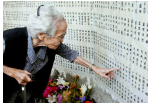
A woman traces the name of deceased kin at memorial service following the verdict