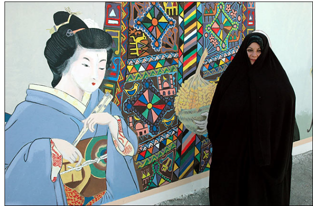
Japan hired Iraqis to renovate the Samawa Secondary School for Girls and provided a mural

The total amount of money that Japan spent on Iraqi reconstruction is impressive. Tokyo pledged US$1.5 billion in grant aid and US$3.5 billion in loans at the Madrid Conference of October 2003. Since that time, MOFA has been announcing various projects on which this money would be spent. MOFA says that the US$1.5 billion in grants has already been completely distributed, and that in fact an additional US$105 million in emergency grant aid was provided to Iraq over the course of 2007 (see Shingetsu Newsletter No. 529). Beyond all of this, Tokyo has pledged to forgive 80% of Iraq's debts from the Saddam Husain era, which totaled about US$7.6 billion (see Shingetsu Newsletter No. 123). I'm not an economist, but I wouldn't be surprised to learn that the real cost of the Iraq adventure to the Japanese taxpayer is now well over US$10 billion.