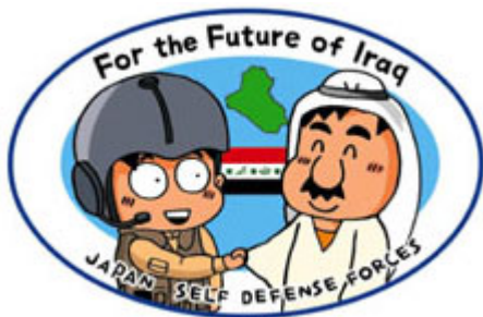
SDF charm offensive in Iraq. This image appeared on Japanese water trucks

Tokyo has since stepped up its cooperation with Washington, from missile defense to the realignment of U.S. forces. 'It shows that Japan and the United States got closer because of the decision to send the SDF to Iraq,' says a senior Foreign Ministry official.