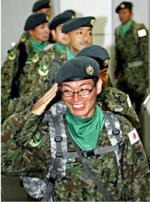
SDF forces deployed to Iraq

Tokyo has since stepped up its cooperation with Washington, from missile defense to the realignment of U.S. forces. 'It shows that Japan and the United States got closer because of the decision to send the SDF to Iraq,' says a senior Foreign Ministry official.