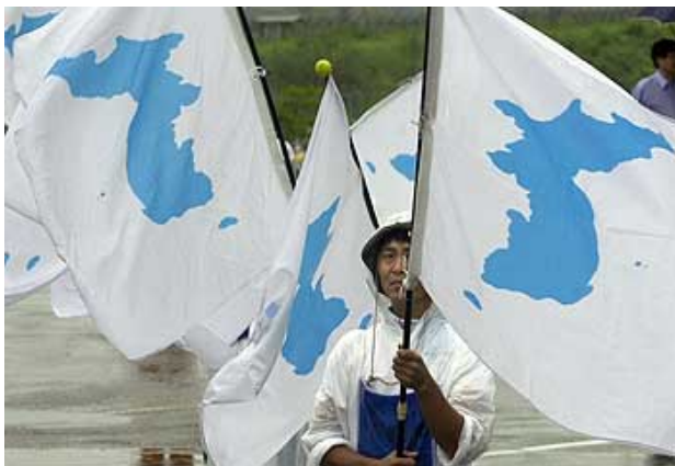
The unification flag used since 1991

During 2007 formal inter-Korean talks on a joint Olympic team took place in Kaesong in February, with more informal contacts in Kuwait in April and in Hong Kong in June 2007, but no solution was achieved. There is considerable agreement on issues such as the flag (the unification flag), the national anthem to be played when medal winners are on the podium (the 1920s version of the traditional Korean folk song 'Arirang'), and the uniforms (following earlier designs but all supplied by the South). One key area remains outstanding – and it is an issue that has remained since those early days of the 1960s – how to choose the athletes to compete.