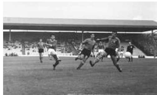
Pak Doo-ik kicks North Korea's winning World Cup goal against Italy

activity became an important part of societal mobilization and development. Mass sports involving gymnastics became a regular feature of North Korean society. Nonetheless, throughout the 1960s and 1970s both Koreas remained relatively low-key in terms of participating in international sporting events, with the notable example of the North Korean soccer team's almost legendary exploits in the 1966 World Cup in England.