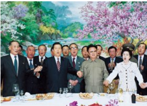
The two Kims and entourage following the June 15, 2000 Joint Declaration

way for greater cooperation and collaboration in North-South Korean relations. Consequently, at the 2000 Sydney Olympics the two Koreas entered the Olympic stadiums under a joint flag (the so-called ‘unification flag’, consisting of a blue outline of the undivided Korean peninsula on a white background) and wearing identical uniforms at the opening ceremonies. It was an emotional moment for Koreans. However, the athletes competed as two separate national teams.