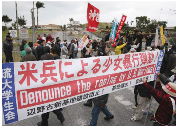
Okinawan protest at Marine Headquarters in Kita Nakagusuku village following news of the rape

Once an incident "blows over", as this latest one now has, the pundits and diplomats go back to their boiler-plate pronouncements about the "long-standing and strong alliance" (Rice in Tokyo), about how Japan is an advanced democracy (although it has been ruled by the same political party since 1949 except for a few years after the collapse of the Soviet Union), and about how indispensable America's empire of over 800 military bases in other people's countries is to the maintenance of peace and security.