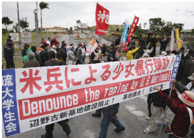
Okinawan protest at Marine Headquarters in Kita Nakagusuku village following news of the rape

Once an incident "blows over", as this latest one now has, the pundits and diplomats go back to their boiler-plate pronouncements about the "long-standing and strong alliance" (Rice in Tokyo), about how Japan is an advanced democracy (although it has been ruled by the same political party since 1949 except for a few years after the collapse of the Soviet Union), and about how indispensable America's empire of over 800 military bases in other people's countries is to the maintenance of peace and security.