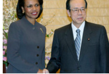
Secretary of State Rice expressed "regret" in meeting with Prime Minister Fukuda

Occasionally the remorse goes up to the Pacific commander-in-chief or, in the most recent case, to the secretary of state. On February 27, Condoleezza Rice said, "Our concern is for the girl and her family. We really, really deeply regret it." The various officers responsible for the discipline of US troops in Japan invariably promise to tighten supervision over them, who currently number 92,491, including civilian employees and dependents. But nothing ever changes. Why?