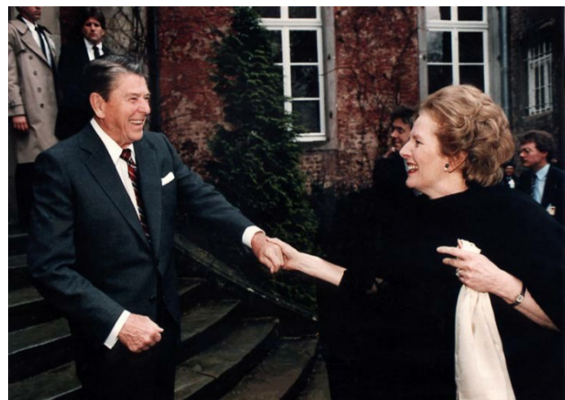
Reagan and Thatcher

That was a world that had seen Japan proclaimed as the world's number one economy by every criterion that mattered save sheer size. Japan had emerged from the mid-seventies recession more rapidly than any other developed country; the growth of its exports accounted for some 25 percent of total global growth in exports in 1976. Companies world wide lived in fear of Japanese competition. Japan had been the key player in the four country effort to rescue the dollar in the summer of 1978; three years later, Japan would be financing and enabling the American experiment in the simultaneous tight monetary and loose fiscal policies (aka the "Reagan Revolution") that would lay the groundwork for the restoration of the dollar's primacy in global finance and the American economy recovery.