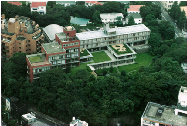
Rockefeller-funded International House in its latest expansion

humanities given by the Rockefeller Foundation reportedly amounted to $37.6 million, of which about $7 million (roughly 19 percent) was earmarked for work in history.[45] Apparently, Japanese historians attracted the attention of American philanthropic foundations, including the Rockefeller Foundation.