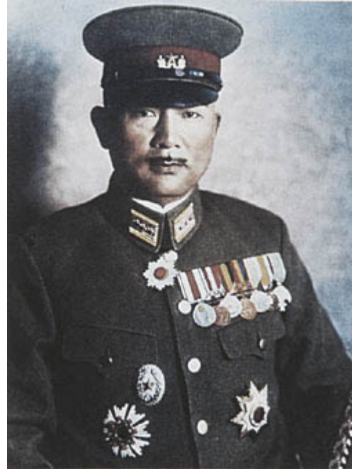
Gen. Kuribayashi Tadamichi, Commander of Japanese forces, Iwo Jima.

In that light, you might say that the Battle of Iwo Jima (February 19 to mid-March 1945 [5]), about which Clint Eastwood recently made twin films, one from the perspective of the defenders, did not create more deaths among Japanese forces than the Battle of Saipan only because the sulfuric island, one third the size of Manhattan, could not sustain more soldiers. The gyokusai there claimed 21,000 lives (1,000 surviving).