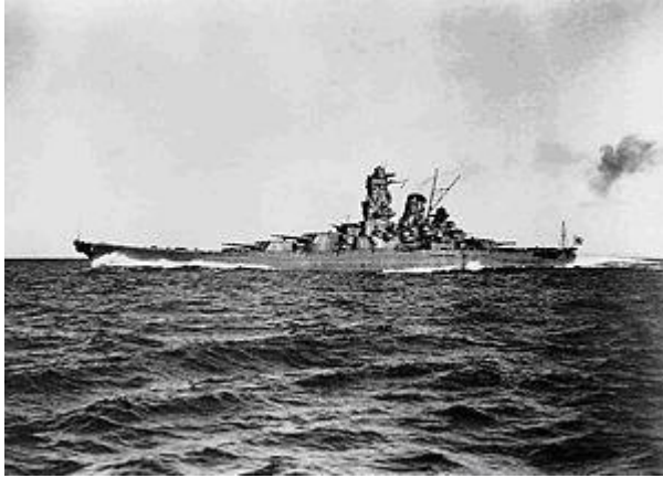
Battleship Yamato running trials

Photo # NH 62582 Explosion of Japanese battleship Yamato, 7 April 1945