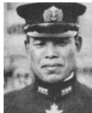
Vice Adm. Ito Seiichi

The so-called kamikaze tactic [7] was put into practice during the Battle of Leyte Gulf (October 23-25, 1944).[8] Less than half a year later, when Vice Adm. Ito Seiichi showed reluctance to lead Japan’s last sizable naval sortie, without air cover, to Okinawa on a similar suicidal mission, he was told, “You are requested to die gallantly in advance of the 100-million gyokusa! ”[9]