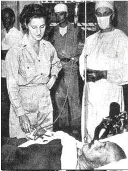
Tojo Hideki rescued after suicide attempt