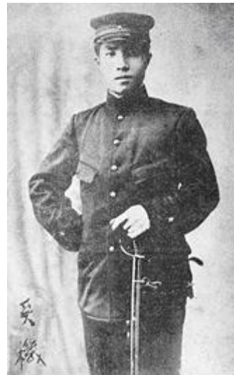
Tojo Hideki as a young army officer

That one notion behind gyokusai in any event, had to be that of the injunction, "Die, rather than become a POW," in the Senjinkun "The Code of Conduct on the Battlefield" – was not exactly what I was thinking when I heard the news of the Okinawan protest rally, but just then I happened to be looking at the injunction and the code, in puzzlement and wonderment.