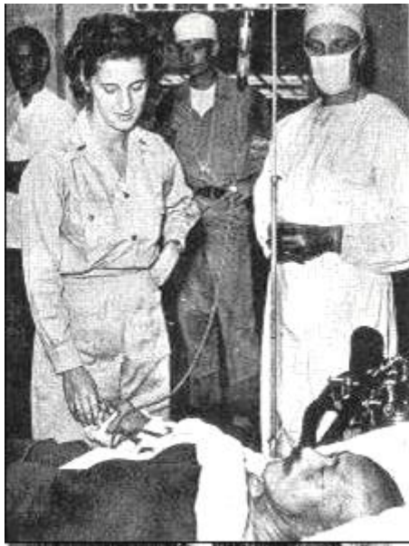
Tojo Hideki rescued after suicide attempt