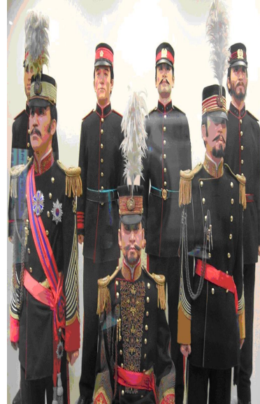
Lt. Gen. Yamashita Tomoyuki

The Battle of the Philippines (fall 1944 to August 1945) is not usually cited as an example of gyokusai but its essence was the same. Lt. Gen. Yamashita Tomoyuki, whom Tojo demoted after he made his name in Malaysia, suddenly found himself assigned to a place where no fortification efforts had been made and where his troops were woefully equipped and provisioned. What was the mission given him, then? Prolonging the war as long as possible against an enemy materially and numerically vastly superior. Yamashita told his troops, “Carry out resistance in perpetuity to provide assistance to the never-ending Imperial Fortune by turning yourselves into human pillars, unperturbed, for the Imperial Nation.”[6] The “human pillar” or hitobashira is the idea dating from mythological times of sacrificing a human being to placate whatever it is that is creating havoc. The result: more than 450,000 Japanese soldiers died.