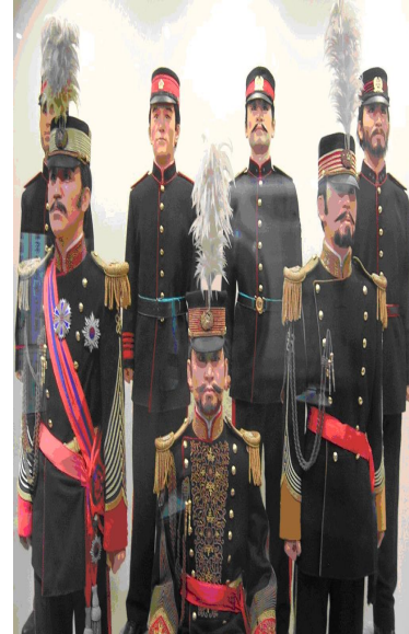
Lt. Gen. Yamashita Tomoyuki

The Battle of the Philippines (fall 1944 to August 1945) is not usually cited as an example of gyokusai but its essence was the same. Lt. Gen. Yamashita Tomoyuki, whom Tojo demoted after he made his name in Malaysia, suddenly found himself assigned to a place where no fortification efforts had been made and where his troops were woefully equipped and provisioned. What was the mission given him, then? Prolonging the war as long as possible against an enemy materially and numerically vastly superior. Yamashita told his troops, “Carry out resistance in perpetuity to provide assistance to the never-ending Imperial Fortune by turning yourselves into human pillars, unperturbed, for the Imperial Nation.”[6] The “human pillar” or hitobashira is the idea dating from mythological times of sacrificing a human being to placate whatever it is that is creating havoc. The result: more than 450,000 Japanese soldiers died.