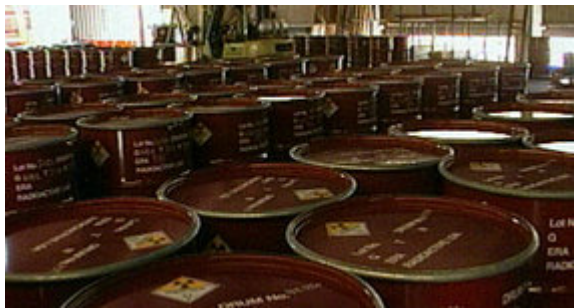
Indonesia plans to expand its fledgling nuclear industry

Indonesia is active in uranium milling, processing and conversion. Its nuclear research program spans five decades. Three research reactors are in operation with a fourth planned. Indonesia hosts at least two uranium mines capable of supplying sufficient yellowcake to service domestic needs for planned reactors. While Indonesia operates under IAEA safeguards, SIPRI's stated concern is that given the questionable security of the management of nuclear waste, "it is conceivable that terrorist organizations could utilize its spent waste in a radiological device ("dirty bomb"). [15] Perhaps of greater concern is the combination of unstable geological conditions and dubious safeguards to control the technology.