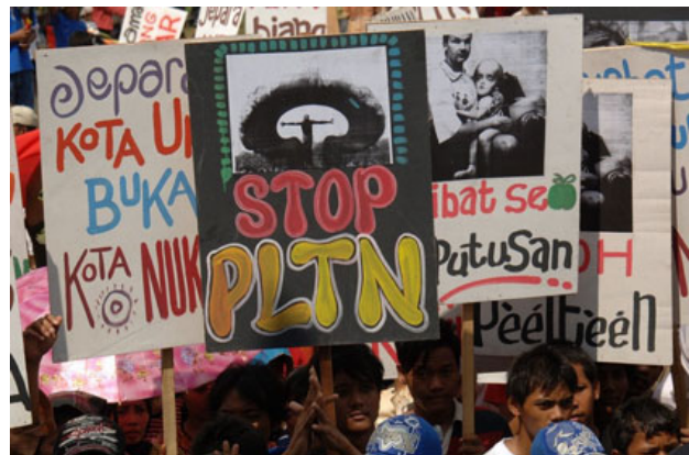
Rally followed the Ulama fatwa declaring the Muria site haram .

In June 2007, some 4,000 demonstrators against the project rallied at the central Javanese site, including a local chapter of Greenpeace. In October, 100 clerics and scholars from the largest Muslim organization in Indonesia, Nahdatul Ulama, descended on the site and, after deliberations, issued a fatwa declaring the Muria site haram or forbidden, albeit more on pragmatic than strictly religious grounds. [14]