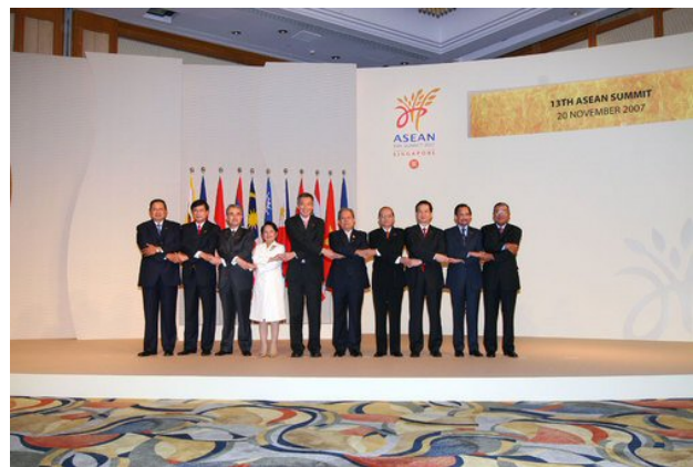
The 13th ASEAN Summit meeting held in Singapore in November 2007

Japan's recent nuclear disaster. [2] Singapore, host of the ASEAN summit meeting, made known its concerns.