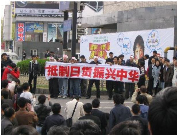
2005 Beijing demonstration calls for boycott of Japanese goods

There is no real public opinion in China. So-called 'public opinion' is all under state control, guidance and manipulation. If public opinion is not welcomed by the government, it will be immediately erased. If an opinion conforms to government views, then it will be encouraged. For instance, the government does not allow any street protest regardless of the reason, yet anti-Japanese protests alone were 'freely' conducted right in front of the military police.