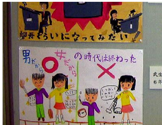
Artwork by elementary school children in a poster contest in Takefu City, Fukui Prefecture in 2000. poster depicts sharing work at home.

unified local elections) in post-WWII Japan. (Koizumi's popularity did not significantly reverse the trend; the turnout was 59.9% in the 2003 lower house election and 56.6% in the 2004 upper house election.) While this could be a sign of widespread political apathy, it is more likely a reaction to the old politics of pork barreling that has long favored special interest groups. In this respect, it is political alienation rather than apathy that may appropriately explain the degree and nature of political disengagement in Japan. Currently, there is an exceptionally high demand for an alternative politics, which is unparalleled in Japan's recent history. This has provided an opportunity for reformists and new political groups to work towards democracy-building. Already, forward-looking women's groups in Japan are proposing alternative forms of political renewal.