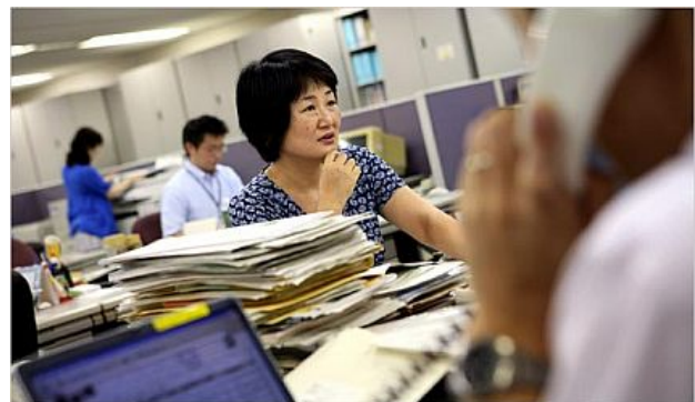
Japanese women office workers

Even more critical, according to the February 2006 data compiled by the Inter-Parliamentary Union (IPU), Japan stood in 105 th place on women's shares of seats in a lower or single house (9 percent). Today, many developing countries such as Rwanda (48.8 percent), Pakistan (21.3 percent) and the Philippines (15.7 percent) far exceed Japan in terms of women's share of seats in a lower or single house. [5]