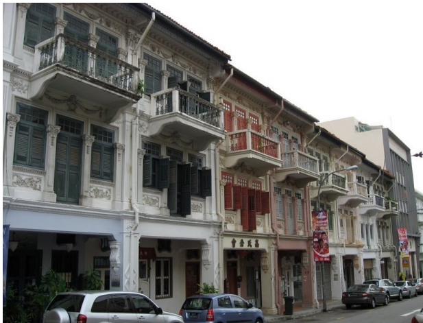
Shophouses on Bukit Pasoh Road where comfort women once worked

stations" in Singapore also included Korean and Indonesian women, as well as some Japanese women reserved for the officers. [2] Lines of Japanese soldiers waiting stolidly for their turn on the bodies of "comfort women" became a common sight. Enterprising local boys gathered up used condoms outside the comfort stations, washed them, put them in bamboo tubes, powdered them, rolled them up and resold them to Japanese soldiers.[3]