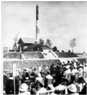
Opening ceremony at Syonan Chuureitou

The Syonan Chureito, a shrine and memorial dedicated to the war dead on the summit of Bukit Batoh Hill, was a grander affair, memorializing the battle for Singapore. The ashes of Japanese troops killed in the campaign rested here beneath a 15-meter wooden cylinder topped in a rather phallic fashion by a brass cone.