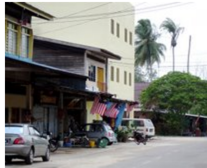
Kampong Hubong was once New Syonan

These days Kampong Hubong is a cul-de-sac on the map of Malaysian modernization. But once, for just two short years between 1943 and 1945, Kampong Hubong was closer to the core of things: a new community called New Syonan that emerged from the conditions of Japan's occupation of Singapore, and acted as a highway for the delivery of imperial Japanese ideology about Asian unity and cooperation.