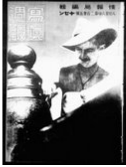
A POW builds Syonan Jinja