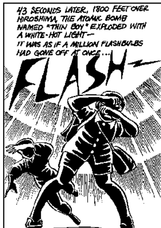
The atomic bomb explodes

went to the countryside, you'd probably be able to eat your fill. But a letter came, and in it he moaned that he was getting thinner and thinner and please send soybeans. So I heard Dad say more than once, "I wonder if we should bring him back." It was just before the atomic bomb. Had Dad brought him back, they'd have died together in the atomic bombing. Even if you went to the countryside, you couldn't eat your fill: I realized that keenly.