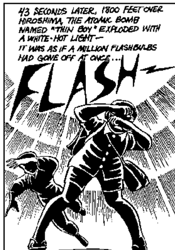
The atomic bomb explodes

went to the countryside, you'd probably be able to eat your fill. But a letter came, and in it he moaned that he was getting thinner and thinner and please send soybeans. So I heard Dad say more than once, "I wonder if we should bring him back." It was just before the atomic bomb. Had Dad brought him back, they'd have died together in the atomic bombing. Even if you went to the countryside, you couldn't eat your fill: I realized that keenly.