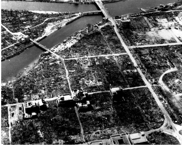
Aioi bridge after the atomic bomb.

The atomic bombing was terrible, of course, but we also suffered afterward from hunger. For a while we stayed in Eba. After the war the food shortage was really severe. At the river's mouth in Eba, when the tide went out, there stretched an array of rib bones. If you dug under the rib bones, there were lots of short-necked crabs. They fed on the bodies. Lived off of human beings. We gathered the crabs for all we were worth and with them appeased our hunger. Would you say we were blessed by the sea?—there were the seven rivers, and it really helped us appease our hunger.