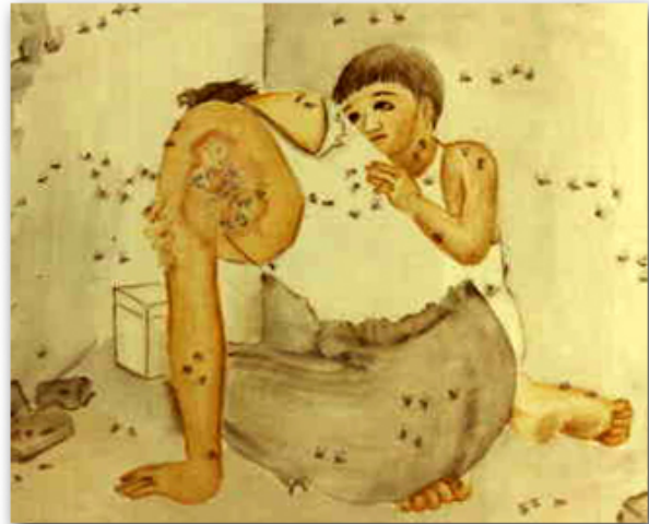
A child clings to mother whose wounds bred maggots

The thing that horrified me most was that maggots bred and turned into flies. There were so many flies! It became so black you almost couldn't open your eyes. And they attacked you! Despite the atomic bomb, flies bred. It's strange, but maggots are really quick. In no time at all they were everywhere. Horrible, really. And that maggots should breed like that in human bodies! If you wondered what that was moving in the sky, it was a swarm of flies. The only things moving in Hiroshima were flames as corpses burned, and flies as they swarmed.