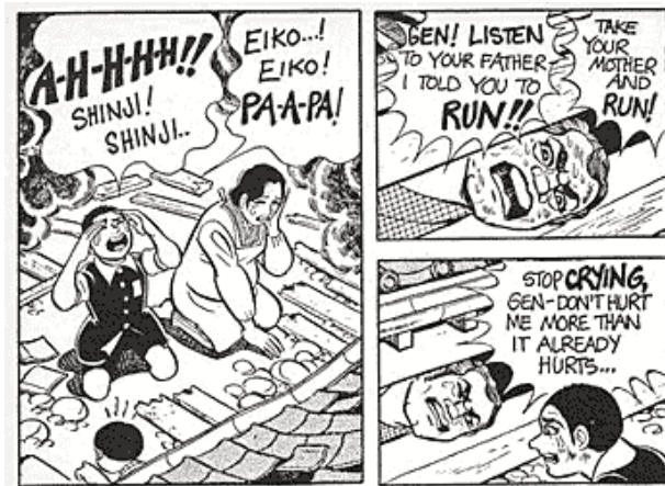
Gen's father's death

Gen be there and try to save his father.