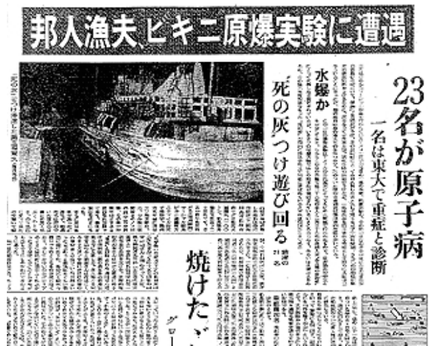
Yomiuri newspaper reports on the Lucky Dragon #5, March 16, 1954

do you get it? That's how badly hibakusha were alienated.