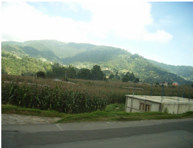
Laotian corn field

Louang Namtha province in northern Laos lies just across the border from China. The 68-year-old president of a major trading company lamented: "I can't find any corn. My business is suffering." Corn is being gobbled up by private traders who cross over from China in hordes. Customs authorities don't bother to stop single trucks with a load full of corn. "Chinese trading companies are using at least a few hundred private operators so that they can save on taxes," the company president said testily.