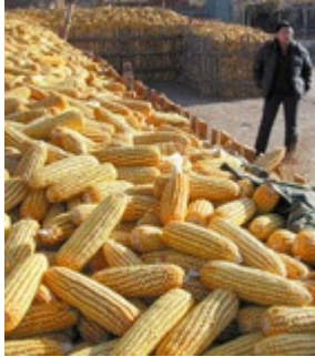
Corn left to dry in Chenjia village, in Jilin province

China's voracious appetite for imported grain threatens to trigger a food crisis of international proportions, experts say.