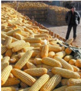
Corn left to dry in Chenjia village, in Jilin province

China's voracious appetite for imported grain threatens to trigger a food crisis of international proportions, experts say.