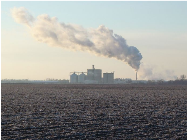
US corn-to-bioethanol plant

The United States produces 40 percent of the world's corn. With the new focus on corn as an ingredient in alternative bioethanol fuel, the United States is cutting back on its corn exports in a big way.