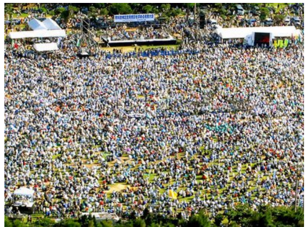
Thousands of protesters in Ginowan, Okinawa,

The resolution adopted by the Okinawan protest rally of September 29 had two points, “withdrawal of the Approval Statement” and “restoration of the wording.”