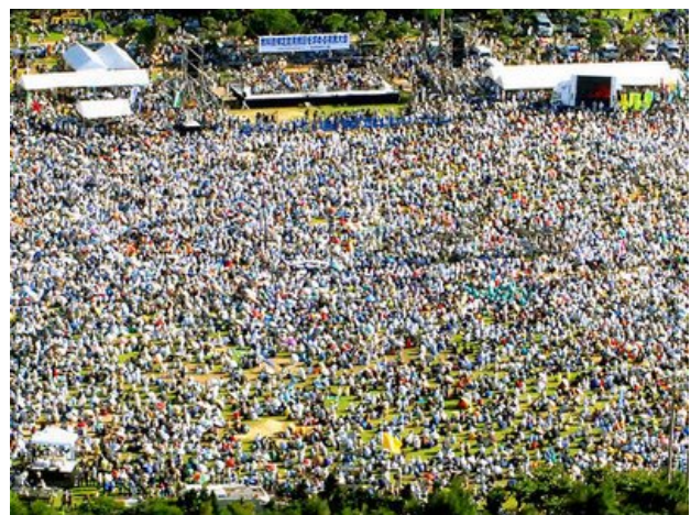
Thousands of protesters in Ginowan, Okinawa,

The resolution adopted by the Okinawan protest rally of September 29 had two points, “withdrawal of the Approval Statement” and “restoration of the wording.”