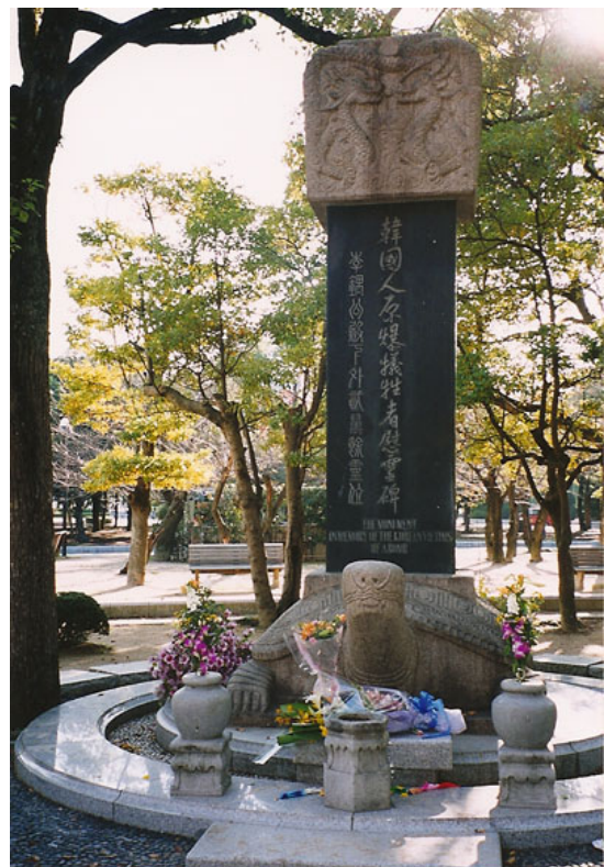
Memorial for the Korean victims of atomic bombing in Hiroshima