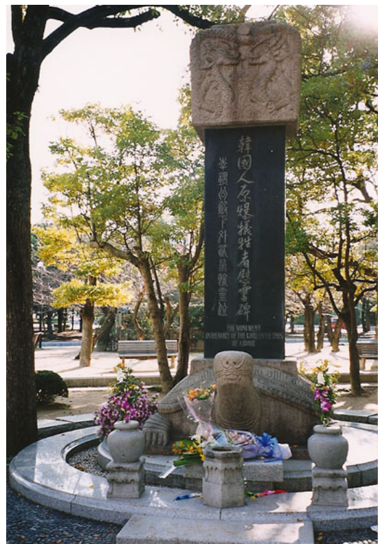
Memorial for the Korean victims of atomic bombing in Hiroshima