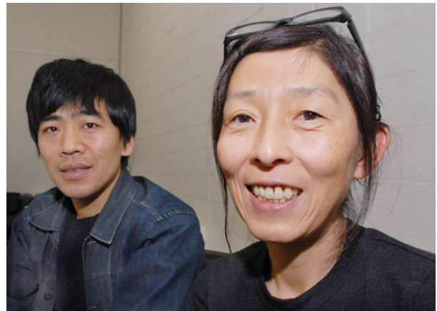
Nishizawa Ryue (left) and Sejima Kazuyo

Being an architect requires patience and endurance. For argument's sake, let's just say it's 2002 and, as the highlight of your career to date, you win the competition to design a new art museum in one of the most prized locations in the world: Manhattan.