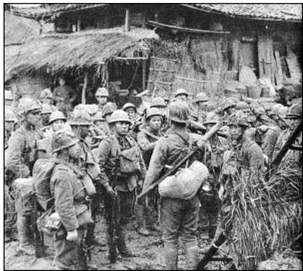
Kwantung Army soldiers in the field

Until the Manchurian Incident in 1931, the army was a little over 10,000-strong. The Kwantung Army was responsible for planning the assassination of Zhang Zuolin as well as orchestrating the Liutiaohu Incident. After the Manchurian Incident, the troop strength was reinforced to suppress anti-Japanese resistance and engage in campaigns to invade northern China and Inner Mongolia. The notorious 731 Unit, which conducted human experiments to develop chemical weapons, was a unit of the Kwantung Army.