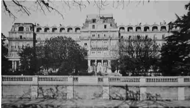
League of Nations Headquarters, Geneva

"Did Lytton really receive 'Truth'?" I inquired at the library. Two days later, the library responded to the effect that the booklet had been located among League-related materials.