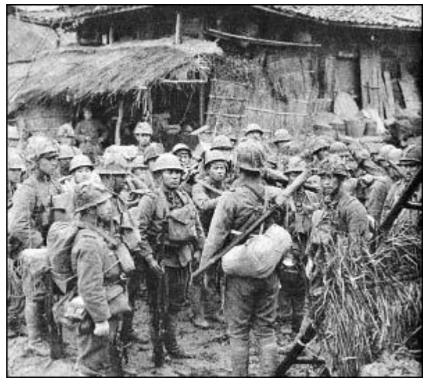
Kwantung Army soldiers in the field

Until the Manchurian Incident in 1931, the army was a little over 10,000-strong. The Kwantung Army was responsible for planning the assassination of Zhang Zuolin as well as orchestrating the Liutiaohu Incident. After the Manchurian Incident, the troop strength was reinforced to suppress anti-Japanese resistance and engage in campaigns to invade northern China and Inner Mongolia. The notorious 731 Unit, which conducted human experiments to develop chemical weapons, was a unit of the Kwantung Army.