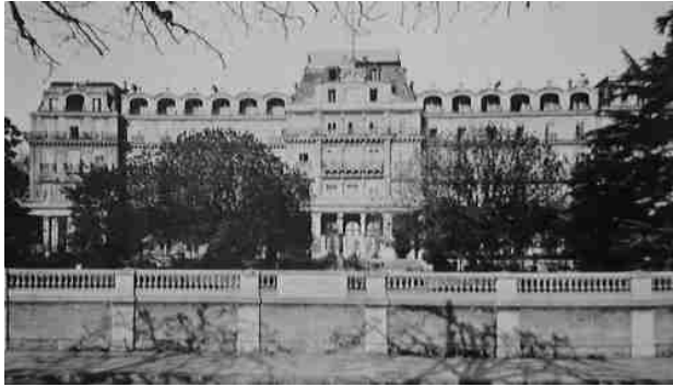
League of Nations Headquarters, Geneva

"Did Lytton really receive 'Truth'?" I inquired at the library. Two days later, the library responded to the effect that the booklet had been located among League-related materials.