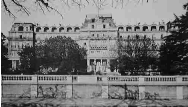
League of Nations Headquarters, Geneva

"Did Lytton really receive 'Truth'?" I inquired at the library. Two days later, the library responded to the effect that the booklet had been located among League-related materials.