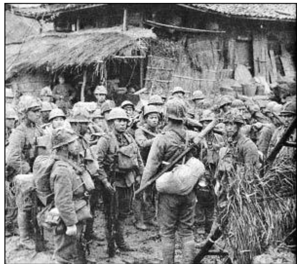
Kwantung Army soldiers in the field

Until the Manchurian Incident in 1931, the army was a little over 10,000-strong. The Kwantung Army was responsible for planning the assassination of Zhang Zuolin as well as orchestrating the Liutiaohu Incident. After the Manchurian Incident, the troop strength was reinforced to suppress anti-Japanese resistance and engage in campaigns to invade northern China and Inner Mongolia. The notorious 731 Unit, which conducted human experiments to develop chemical weapons, was a unit of the Kwantung Army.