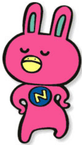
The collapse of Nova Corp., Japan's biggest employer

The unraveling of one of Japan's most popular high-street companies has riveted nightly TV viewers. The ubiquitous bunny fronted the nation's largest private language chain with 924 branches, controlling nearly half the lucrative market for English-language teaching; two generations of Japanese had their first and sometimes only encounter with a foreigner across the table of a Nova classroom.