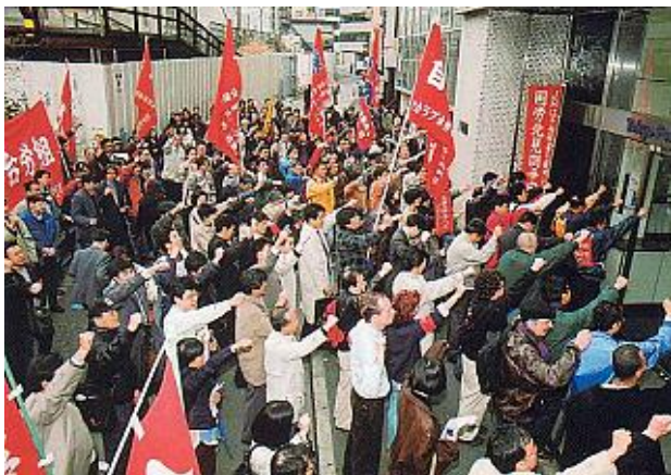
National Union of General Workers, Tokyo