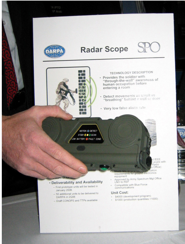
Radar Scope to sense through walls