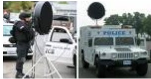
Longrange Acoustic Device

revealed that the Los Angeles County Sheriff's Department had begun testing the use of remote-controlled surveillance UAVs -- not unlike those now operating above Iraqi cities -- over their own megalopolis.