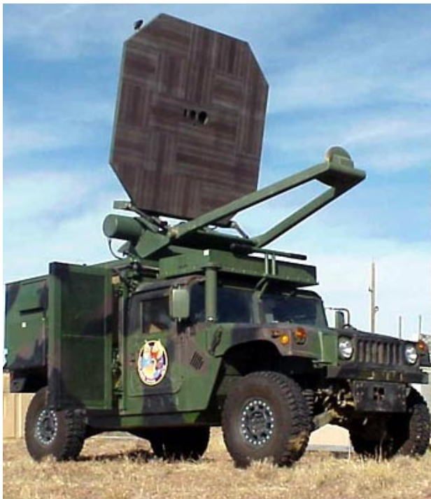
Active denial system

Denial System which inflicts an intense burning sensation on victims -- were reoccurring favorites of the gathering. During their PowerPoint presentation, the men from Lite Machines, for instance, showed a computer rendering of their micro-UAVs attacking an unarmed crowd gathered in a town square with a variety of less-than-lethal weapons like disorienting laser dazzlers and chemical gases (vomiting and tear-gas agents), while a company spokesman regretfully mentioned that international regulations have made it impossible to employ such gases on the battlefield. Undoubtedly, this was a reference to the scorned Chemical Weapons Convention, which has been binding for the last decade.