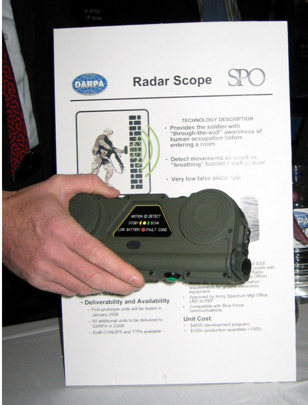
Radar Scope to sense through walls