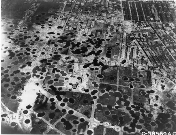
Osaka damage from bombing raids