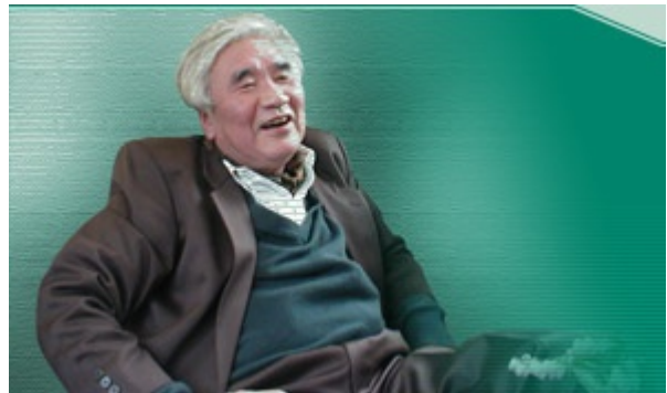
Oda Makoto at 75

On 30 July, 2007, social and political critic, novelist and political activist Oda Makoto died in Japan at the age of 75. Throughout his life, he published numerous essays and more than 100 books including some thirty novels. Two of his novels, Hiroshima and Gyokusai (The Breaking Jewel), have been translated into English and dramatized for a BBC radio program and broadcast worldwide. In Japan, however, he is remembered above all as the political activist who founded and led Beheiren (Japan Peace-for-Vietnam Citizen's Alliance), a major grassroots movement against the Vietnam War, which gained extraordinary popular support in the 1960s and 1970s.