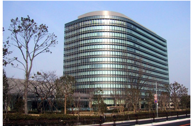
Toyoto Corporate Headquarters, Toyota City

In the past if there was a long recession, companies would attempt to stimulate a recovery of the domestic market and increase market share. Increased wages were seen as a way to boost consumer spending. Because companies were engaged in this cycle, they could claim that “corporate prosperity benefits the people of the nation.” Corporate management once thought that if society prospered then the company would also prosper. This was the case for Toyota, too.