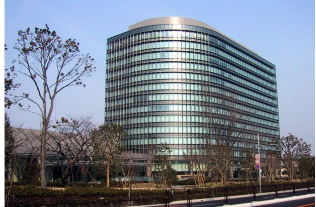
Toyota Corporate Headquarters, Toyota City

In the past if there was a long recession, companies would attempt to stimulate a recovery of the domestic market and increase market share. Increased wages were seen as a way to boost consumer spending. Because companies were engaged in this cycle, they could claim that “corporate prosperity benefits the people of the nation.” Corporate management once thought that if society prospered then the company would also prosper. This was the case for Toyota, too.