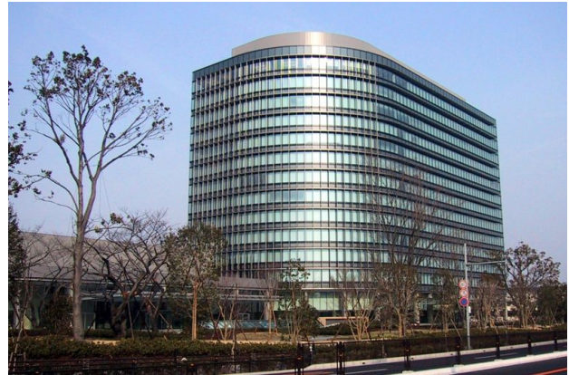
Toyota Corporate Headquarters, Toyota City

In the past if there was a long recession, companies would attempt to stimulate a recovery of the domestic market and increase market share. Increased wages were seen as a way to boost consumer spending. Because companies were engaged in this cycle, they could claim that “corporate prosperity benefits the people of the nation.” Corporate management once thought that if society prospered then the company would also prosper. This was the case for Toyota, too.