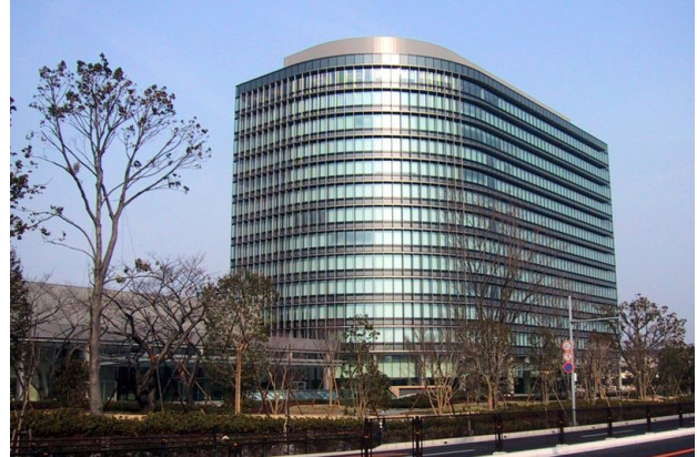
Toyoto Corporate Headquarters, Toyota City

In the past if there was a long recession, companies would attempt to stimulate a recovery of the domestic market and increase market share. Increased wages were seen as a way to boost consumer spending. Because companies were engaged in this cycle, they could claim that “corporate prosperity benefits the people of the nation.” Corporate management once thought that if society prospered then the company would also prosper. This was the case for Toyota, too.