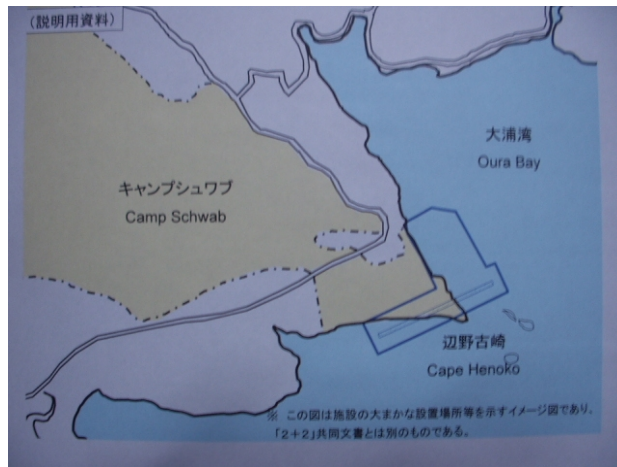
The Henoko Base plan

port (theoretically one capable of accommodating nuclear submarines). Since construction would be undertaken based on the existing base facilities, protest access would be much more difficult. It was a plan that could only further inflame Okinawan protest.