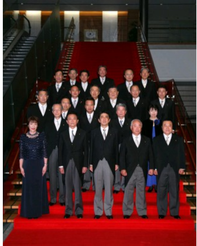
The new Abe cabinet

The electorate seemed unconvinced. Support for his new cabinet did not rise from the low 30s range. Nowhere was the electoral rebuff he suffered more severe than in Okinawa. Few there expected any change of heart and most braced themselves for confrontation rather than conciliation. Before, during, and after the election, trust in the Abe administration, even on the part of the supposedly conservative local government, was at historically low ebb.