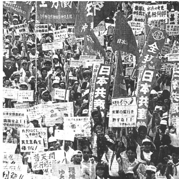
October 22, 1995 protest march and rally