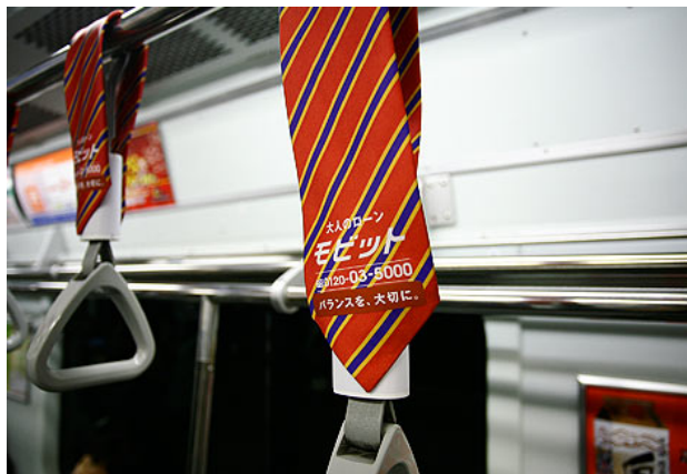
Subway ad for a loan company