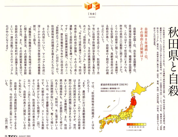
Suicide rates in Tohoku shown in red