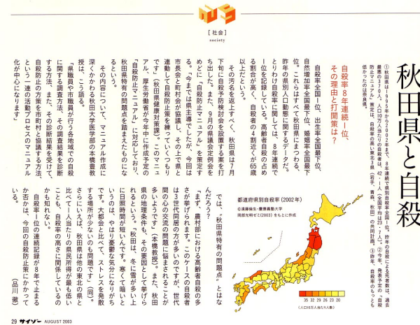
Suicide rates in Tohoku shown in red