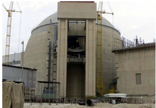
The main building of the Bushehr nuclear power plant (2003)

power plant in Iran. Indeed, Russia has "politicized" the issue and is unlikely to dispatch nuclear fuel for Bushehr as long as the Iran nuclear file remains open. Despite the chill in Russian-US relations, Washington and Moscow have always closed ranks on issues affecting the preservation of the "nuclear club".