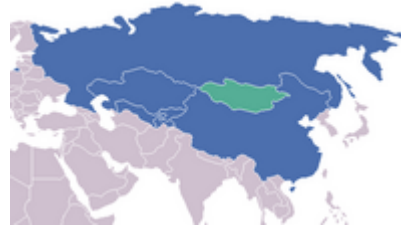
Map showing SCO military exercises centered on Xinjiang

The government-owned China Daily underlined that the exercises show that "SCO cooperation over security has gone beyond the issues of regional disarmament and borders, for it includes how to deal with non-traditional threats such as terrorists, secessionist forces and extremist religious groups".