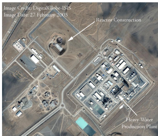
Arak heavy-water plant in 2005 satellite image

But at the same time, the fracas over Bushehr in a curious way gives Russia the handle to stall any further move by the US in the United Nations Security Council to push for a new sanctions resolution against Iran for not stopping its uranium-enrichment program. Moscow-based commentators have highlighted the current visit by International Atomic Energy Agency inspectors to the Arak heavy-water plant in Iran as a "real breakthrough" and as evidence that "Iranians are ready to give the IAEA exhaustive answers".