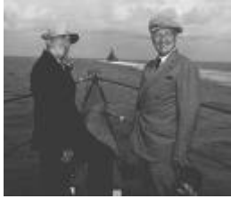
Truman and Byrnes en route to Potsdam, July 11, 1945

Others would also draw, for Truman, the grave implications of using such hellish weapons. Truman noted presciently in his diary on July 25, 1945, after being fully briefed on the results of the Trinity test, that the bomb “may be the fire destruction prophesied in the Euphrates Valley Era, after Noah and his fabulous Ark.”[5] Leading atomic scientists cautioned that surprise use of the bomb against Japan could precipitate an uncontrollable arms race with the Soviet Union that boded future disaster for mankind. The warnings reached Truman’s closest advisors if not the President himself. Truman nevertheless authorized use of atomic bombs against Japan, always insisting he felt no “remorse” and even bragging that he “never lost any sleep over that decision.”[6] For over sixty years, historians and other analysts have struggled to make sense of Truman’s and his advisors’ actions and the relevance of his legacy for his successors in the Oval Office.