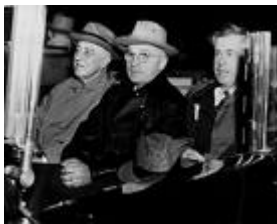
Roosevelt, Truman and Wallace

Roosevelt had asked to stay on as Secretary of Commerce after Truman replaced him as Vice President, struggled valiantly to avert an arms race and ease the threat of nuclear war. When Wallace persisted in criticizing administration policy toward the Soviet Union and the bomb, Truman ousted him from the Cabinet. In his address to a national radio audience on the night he submitted his letter of resignation, Wallace again voiced the theme that provoked Truman's ire, charging that the U.S. government's present course may mean "the extinction of man and of the world." [26] That Truman bears so much responsibility for creating this perilous state of affairs, regardless of his conscious intentions, justifies the application of such a harsh standard of judgment and demands a closer look at the man and his early presidency. For if Harry Truman, a relatively decent man, could behave so irresponsibly, what assurance is there that future presidents, under comparable circumstances, might not do the same? In fact, several have already come frighteningly close.