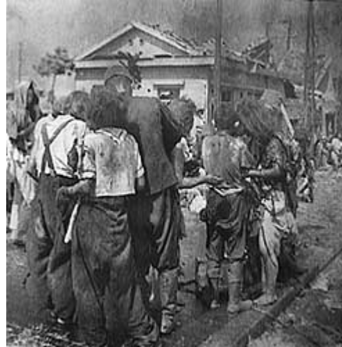
Hiroshima close up near the hypocenter three hours after the bomb

Survivors on the ground, however, unlike crew members flying above, vividly recall the flash from the bomb ( pika ), which signifies the beginning of the tragic narrative, and, when combined with the blast ( don ), left scores of thousands dead and dying and two cities in ruins. No wonder many Japanese refer to the bomb as pikadon and the mushroom cloud that so pervades the American consciousness has been superseded in Japan by images of the destruction of the two cities and the dead and dying.