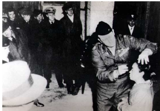
Atomic Bomb Casualty Commission examination

Many hibakusha remain incensed over their treatment by the Atomic Bomb Casualty Commission (ABCC), which the U.S. set up in Hiroshima in 1947 and Nagasaki in 1948 to examine but not treat the bomb victims.