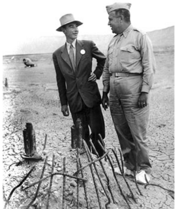
Oppenheimer and Leslie Groves at Trinity test site

terrified many scientists from an early stage in the process was the realization that the bombs that were used to wipe out Hiroshima and Nagasaki were but the most rudimentary and primitive prototypes of the incalculably more powerful weapons on the horizon--mere first steps in a process of maximizing destructive potential.