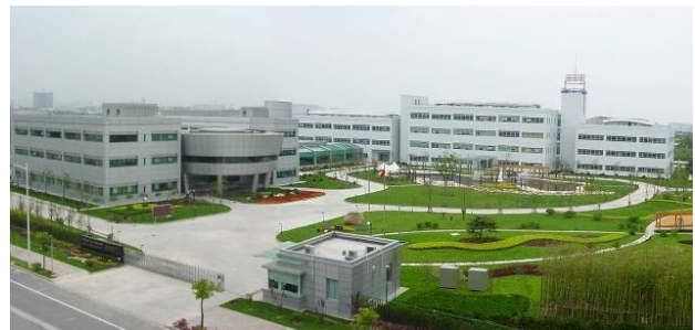
The Shanghai Center for Bioinformation Technology: "a corporate center with strong academic ties"