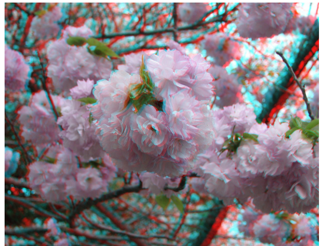
Cherry blossoms of Japan's National Institute of Genetics

The corresponding figure for Japan for the fiscal year ending March 2006 was 17.8 trillion yen, or 3.5 percent of GDP. However, China's expenditure outlays are rising by about 20 percent annually while Japan's have only grown slightly.