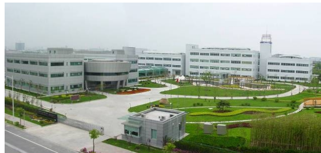
The Shanghai Center for Bioinformation Technology: "a corporate center with strong academic ties"