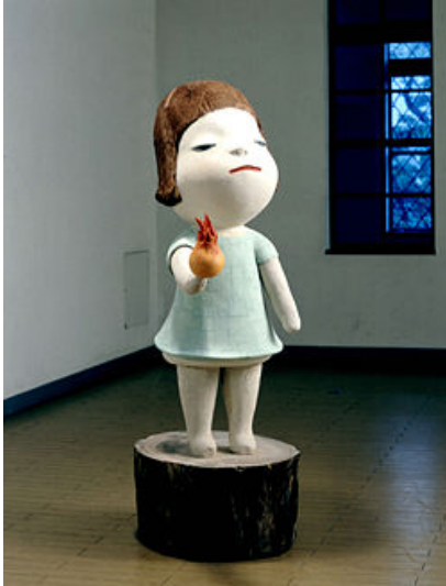
Nara Yoshitomo's Light My Fire from 2001

The first entry in Nara's published diary[20] is dated August 21, 1999. The afterword is dated May 24, 2001. It follows him from Japan to Germany and to the United States and back to Japan. The contradiction between the personal nature of the entries and their public status in a published work is but one example of the tension between the representation of Nara as the simple, lonely, reclusive artist and the phenomenal acclaim he has achieved internationally. There is also the contradiction between his dismissal of pure art and his privileged place in the highest of art magazines. The most direct political commentary in Nara's illustrated picture books (most of which are exhibition catalogs) is the figure of a kamikaze pilot of indeterminate gender and attitude. Nor does the diary, which focuses on the artist's adjustment to moving across borders and his self-conscious attempt at assessing his own work, appear to depart from such introspection. Therefore, the artist's