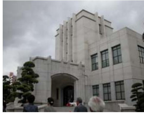
Ichigaya Kinenkan in Shinjuku, Tokyo

stock imagery of the Holocaust. But it is their own use of imagery which sets this inquiry so apart from A Century of Breaks an Era of Witnessing .