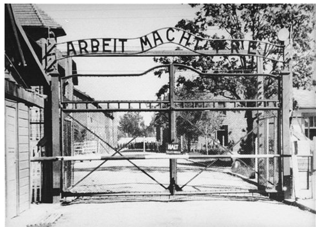
Entrance to Auschwitz

eleven million Europeans, among them Jews, the disabled including the mentally ill, gypsies, homosexuals and political opponents of the Nazi regime which ruled over Europe. It conjures up not only the question, “How can the historian find the language and the form to represent Auschwitz as history, in history?” but also the intense query “Can and should the intellectual write about Auschwitz?”[16]