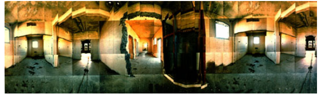
Stockade at Tule Lake

Most recently the journal Zenya has taken up the political cause of expressing the urgent need to counter war, discrimination and colonialism through cultural commentary. I include it here, within the context of visiting, rather than revisiting, because of its concern with our current state of war. Its sense of urgency is expressed in its credo: