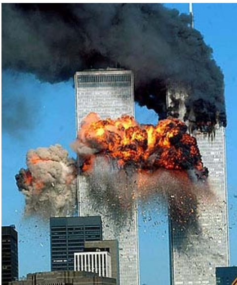
Iconic image of Twin Towers in 9/11 attack

was all but ignored. (cf. Arundhati Roy's similar reference to "what President Bush rather biblically calls 'the task that does not end.'" Roy's response was also similar to Sontag's indictment of Bush's will to power: "I find myself thinking a great deal of the relationships between citizens and the state.") And in a chilling reminder of the rampant excesses of McCarthy's reign, comedian and talk-show host, Bill Maher, saw his program cancelled after a not dissimilar remark.[1]