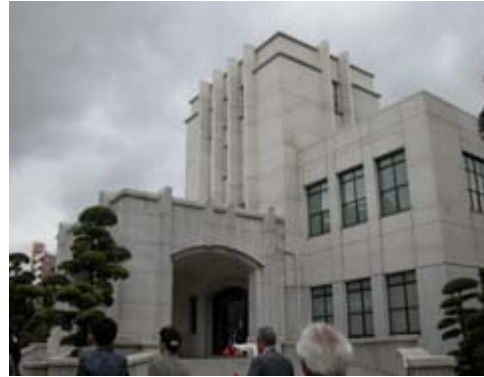
Ichigaya Kinenkan in Shinjuku, Tokyo

stock imagery of the Holocaust. But it is their own use of imagery which sets this inquiry so apart from A Century of Breaks an Era of Witnessing .