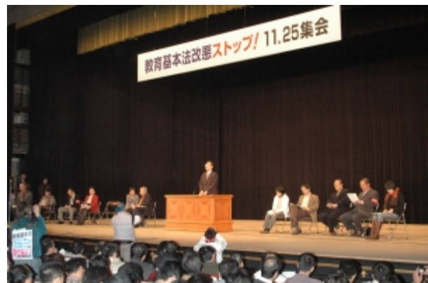
November, 2006 Teachers rally to oppose the revision of the Fundamental Law of Education

Educational reform, however, inevitably rings extra alarm bells in Japan, where many still remember that schools were once little more than the junior wings of the military. The Japan Times reminded its readers after Mr. Abe’s speech that the original 1947 Law was based on the determination “of the Japanese state not to repeat the mistake of creating the ultranationalist, state-centered education system of World War II and before.” In June it said the new education bills were “yet another means to strengthen state control.”