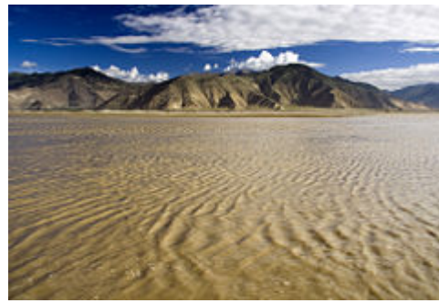
The Yarlong Tsangpo River in Tibet

water resources that should be of greater concern. This concern arises from Chinese attempts to dam or redirect the southward flow of river waters from the Tibetan plateau, where major rivers originate, including the Indus, the Mekong, the Yangtze, the Yellow, the Salween, the Brahmaputra, the Karnali and the Sutlej. Among Asia's mighty rivers, only the Ganges starts from the Indian side of the Himalayas.