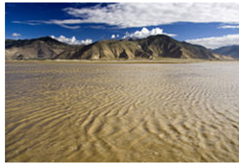
The Yarlong Tsangpo River in Tibet

water resources that should be of greater concern. This concern arises from Chinese attempts to dam or redirect the southward flow of river waters from the Tibetan plateau, where major rivers originate, including the Indus, the Mekong, the Yangtze, the Yellow, the Salween, the Brahmaputra, the Karnali and the Sutlej. Among Asia's mighty rivers, only the Ganges starts from the Indian side of the Himalayas.