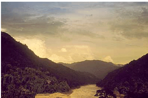
The Brahmaputra River

Following flash floods in India's northern Himachal Pradesh state, however, China agreed in 2005 to supply New Delhi data on any abnormal rise or fall in the upstream level of the Sutlej River, on which it has built a barrage. Discussions are on to persuade it to share flood-control data during the monsoon season on two Brahmaputra tributaries, Lohit and Yarlongng Tsangpo, as it has done since 2002 on the Brahmaputra River, which it has dammed at several places upstream.