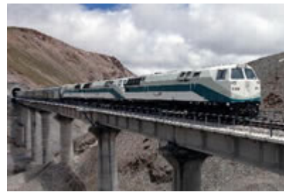
The Qinghai Tibet Railway

Contrast China's reluctance to establish a mechanism intended for mere "interaction and cooperation" on hydrological data with New Delhi's consideration toward downstream Pakistan, reflected both in the 1960 Indus Waters Treaty (which reserves 56 percent of the catchment flow for Pakistan) and the more recent acceptance of World Bank arbitration over the Baglihar Dam project in Indian Kashmir.