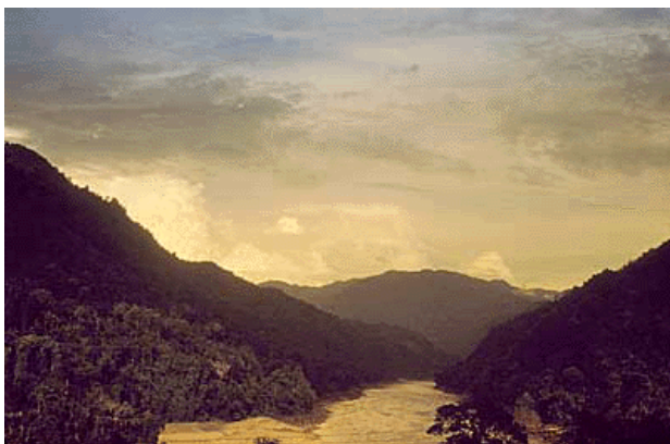
The Brahmaputra River

Following flash floods in India's northern Himachal Pradesh state, however, China agreed in 2005 to supply New Delhi data on any abnormal rise or fall in the upstream level of the Sutlej River, on which it has built a barrage. Discussions are on to persuade it to share flood-control data during the monsoon season on two Brahmaputra tributaries, Lohit and Yarlongng Tsangpo, as it has done since 2002 on the Brahmaputra River, which it has dammed at several places upstream.