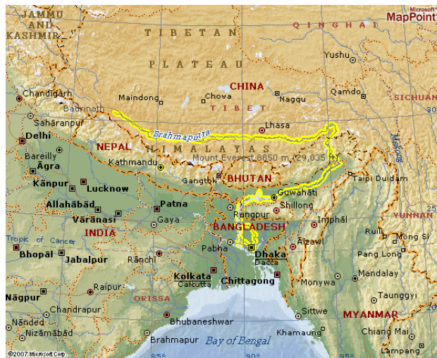
Yarlong-Tsangpo/ Brahmaputra River in Tibet and South Asia

The lopsided availability of water within some nations (abundant in some areas but deficient in others) has given rise to grand ideas — from linking rivers in India to diverting the fast-flowing Brahmaputra northward to feed the arid areas in the Chinese heartland.