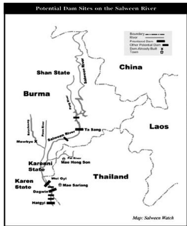
Map 2: Potential dam sites of the Salween River

of that government's efforts to impose control over dissident minorities.