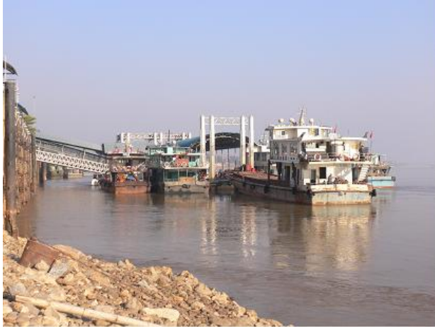
Photograph 2: Chinese vessels at Chiang Saen

As a reflection of the Chinese dominance in this river trade, when I was in Chiang Saen, there were no fewer than 24 Chinese vessels in port and strung out over a distance of some kilometres along the river. This was in contrast to the three Lao vessels I observed, and the total absence of Thai vessels. Anecdotal accounts from Thai informants to whom I spoke in both Chiang Saen and Chiang Khong suggest that the imbalance between Chinese and Thai vessels travelling on the river is of the order of 90% to 10%. In general, Thai vessels are smaller and less powerful than their Chinese counterparts; this fact was the cause for some controversy and resentment during the 2003-04 dry season, when the Mekong fell to unusually low levels. Although this fall was certainly connected to an unusually short wet season and subsequent drought, there is no doubt that the low levels also reflected the fact that the Chinese authorities were holding back water discharges from their dams on the Mekong, at Manwan and Daochaoshan. They did this so that they could then release water in sufficient quantity for Chinese vessels to travel to