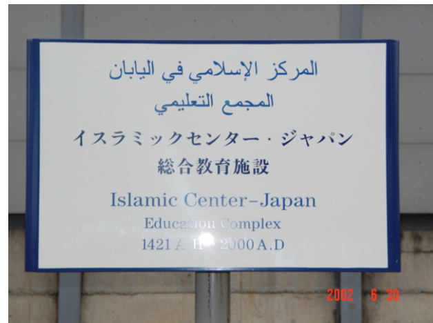
Islamic Center of Japan