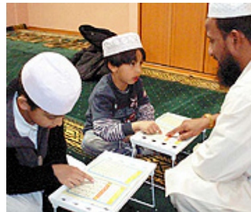
Children learn Arabic at the Yokohama Mosque

At the mosque in Ebina, Kanagawa Prefecture, about 10 children around age 10 are learning the Arabic alphabet. Every day from 4 pm to 8 pm, the mosque holds Koran classes. They started last November, at the urging of Pakistani and Bangladeshi Muslims living in the area who wanted their children to be properly versed in the ancestral religion and the Arabic language. The classes are taught by the parents themselves.