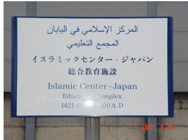
Islamic Center of Japan