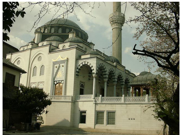
A Tokyo Mosque in Yoyogi

A mosque is more than a place of worship. It occupies a central role in Islamic life. Adults not only pray there but also attend sermons as well, given by religious teachers. Children study the Koran there. The mosque collects charity and assists the poor. It forms the core of the Islamic community.