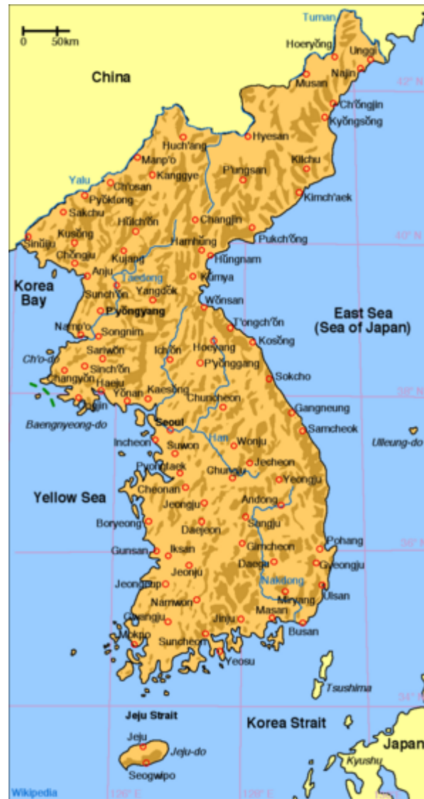
Map of the Korean Peninsula

political and cultural relations so as to maintain a measure of autonomy and cultural distinctness. This history of Jeju Island contributes to the understanding of the nation-state from the perspective of minority ethnic groups, especially those living across territorial borders.