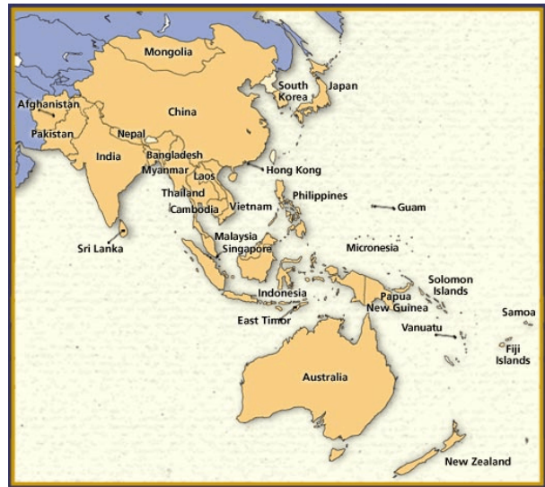
Map of the Western Pacific

Despite centuries of subjugation by larger neighbours—Joseon Korea, Imperial Japan, and South Korea—Jeju island society has maintained a distinct identity and a measure of autonomy. Relations with both Korea and Japan have at times had devastating effects on the islanders, but also contributed to the dynamism of Jeju island society and opened up new routes for islanders to continue traveling as a vital part of their social life.