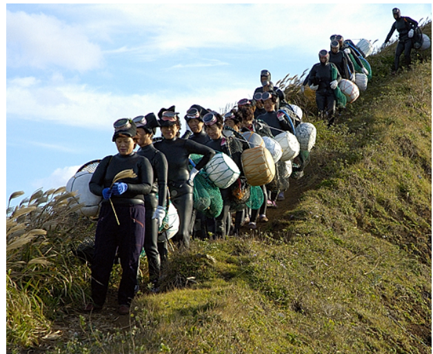
Contemporary Jeju women divers

Although Jeju Islanders' early efforts at resisting Japanese incursions into their fishing areas failed and they moved on to adapting to the new political situation, more bursts of resistance against Japanese rule followed in the 1930s (Yang 1996). Jeju's women divers played a key role in some of these movements (Fujinaga 1989). By then they had fishing rights to the whole Korean peninsula and were used to organizing themselves economically, so although they had no formal schooling, it was a small step for them to form groups to actively agitate for change in areas where their rights were abused.