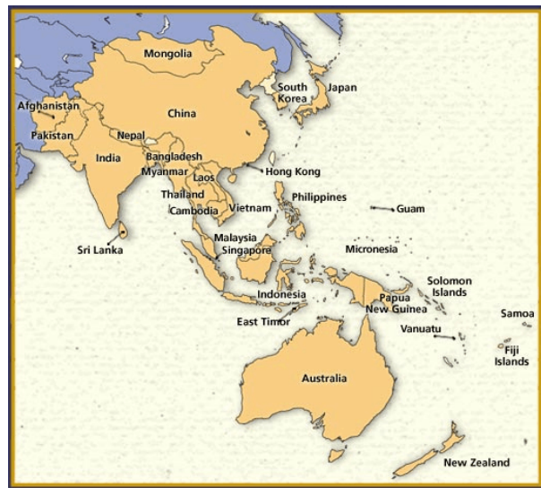
Map of the Western Pacific

Despite centuries of subjugation by larger neighbours—Joseon Korea, Imperial Japan, and South Korea—Jeju island society has maintained a distinct identity and a measure of autonomy. Relations with both Korea and Japan have at times had devastating effects on the islanders, but also contributed to the dynamism of Jeju island society and opened up new routes for islanders to continue traveling as a vital part of their social life.