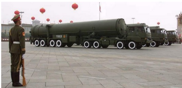
Small Chinese ICBM

Of particular concern are recent media reports that China is developing an infrared system for the Dong Feng 21 medium-range ballistic missile that will allow it to pinpoint ships. China is particularly concerned with overcoming anti-ship missile defenses of Aegis-equipped warships.