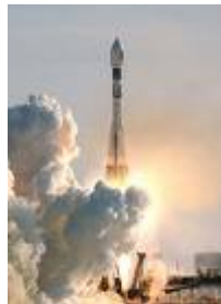
US satellite launch

However, constraining U.S. satellite capabilities would make it nearly impossible to determine what China’s intentions are. Panic and indecision could force the United States to respond more aggressively or too late to a Chinese nuclear strike.