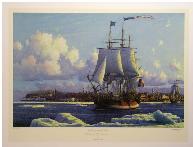
The Empress of China sails

After 1931 Washington's moralistic and legalistic stand against Japanese occupation of Manchuria was certainly helpful in buttressing Chinese morale. During World War II the Roosevelt administration aided China in restoring its great power status. This not only led to the end of the "unequal treaties" between China and Western powers but also promised China recovery of its "lost territories" from Japan. Roosevelt's stumbling on the Mongolia question and his concession to Stalin's Manchurian ambitions at Yalta, however, were not appreciated by Chinese of any political persuasion. After Yalta, Moscow's Mongolian satellite and Manchurian sphere seemed to bear an American stamp.