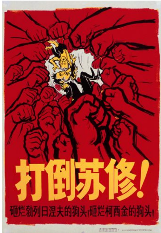
1967 Chinese poster: Down with the Soviet Revisionists!

To policymakers in the West who in the early Cold War years viewed the communist bloc as a monolith, this estimate by the CIA constituted a fundamental change of perceptions. But what “Chinese nationalism” revealed in Beijing’s Cold War diplomacy was much more complex than that demonstrated in the Sino-Soviet rupture. Before treating China as a participant in modern international affairs, we must recognize that in the 19th century and the better part of the 20th century China was a national state in the making. In shaping that process, China’s inter-ethnic affairs in Inner Asia were as vital as China’s international relations in East Asia. Events along China’s northern and western frontiers should