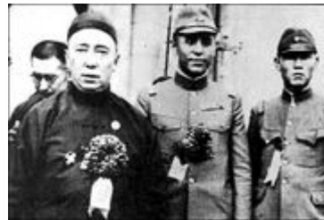
Prince De (left front) in 1930s

ethnopolitical connotations of the Mongolia question could hardly fit into American policymakers' agenda for China. It should be added, however, that the reasons for the incompatibility between the Mongols' and the Americans' interests in China affairs were not one-sided. Between the powerful yet pro-CCP eastern Mongolian movement and the pro-American yet extremely weak "Racial Mongols" and Prince De's group, American policymakers did not have a viable choice even if they had intended to translate their "genuine sympathy" with the Inner Mongols into policy measures. [6]