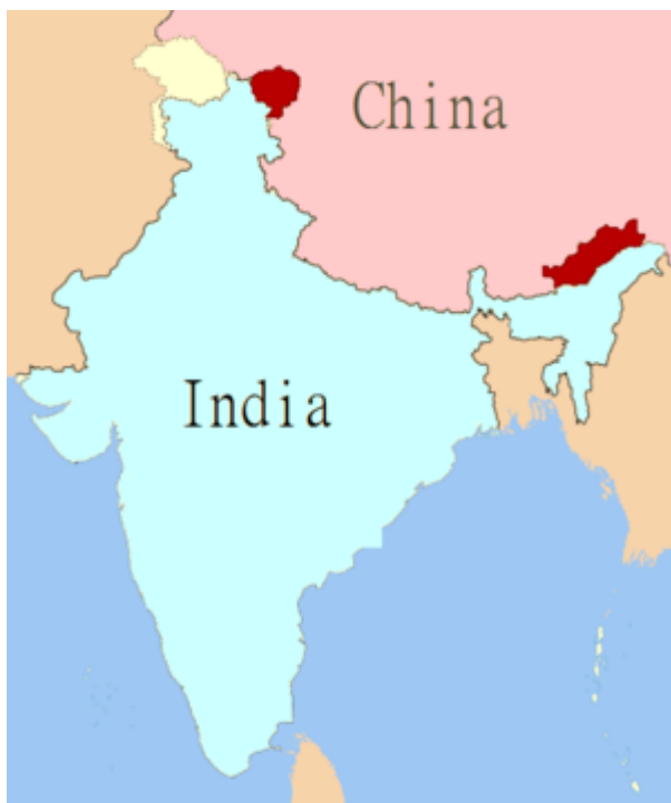
Map shows disputed territories in red at the time of the Sino-India War

“struggle philosophy” had an inner logic, pivoting on the relationship between “part” (jubu) and “whole” (quanju). In May 1959, Mao deployed such logic in finalizing an important letter from the Chinese Ministry of Foreign Affairs to the Indian government. In the letter, Mao sought to explain to the Indian government that the Sino-Indian disagreement over Tibet involved China’s internal affairs and sovereignty. These were “issues of principle” over which China could not make concessions. Yet Mao also appeared conciliatory in suggesting that this disagreement only involved a “temporary” and “partial” problem and should not damage the two nations’ overall cooperation in international affairs.[27]