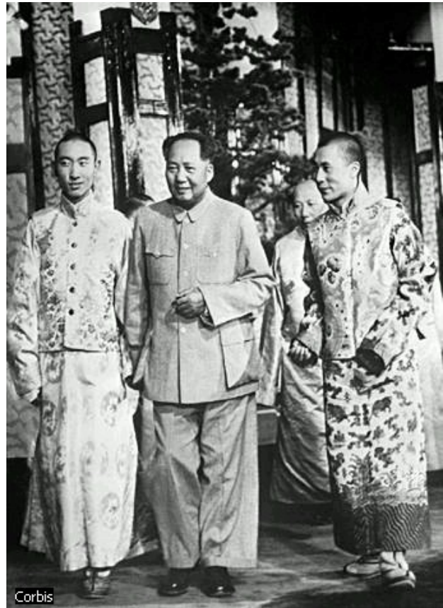
Dalai Lama (r.) and Panchen Lama flank Mao Zedong in Beijing, 1959

the extremist tendencies of the hardliners within the Lhasa regime and among CCP officials in Tibet eliminated any chance for a stable compromise between Beijing and Lhasa.[19]