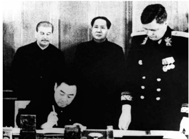
Zhou Enlai signing the Sino-Soviet Treaty in Moscow

forces surrounding and intervening in Mongolia—China, Russia and Japan—were alternately hostile and conciliatory toward each other, while constantly keeping Mongolia divided. This was the case even when Mao Zedong and Joseph Stalin forged their “Communist monolith” over the Eurasian landmass. Under the circumstances, the independent Mongolian state could be easily viewed as a geopolitical creation of others’ schemes but not a dynamic national entity of its own devices, above all in light of the large Mongol population living across the border in Inner Mongolia.