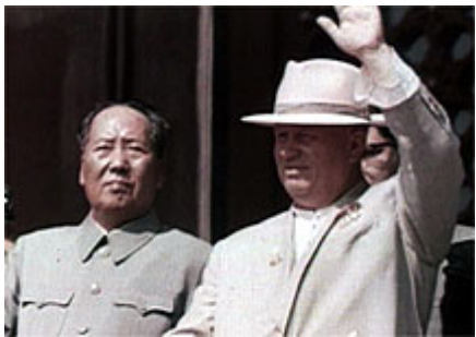
Mao and Khrushchev in Beijing

Not surprisingly, Mao and his associates refused to accept any of these criticisms, reciprocating the Soviets by labeling their attitude as opportunism. The Chinese side stressed that both Taiwan and Tibet were China's internal affairs and China could not possibly retreat from its principled stand. CCP leaders wondered why, as a "big brother," the Soviet Union should make no distinction between right and wrong and take the side of bourgeois India in the Sino-Indian conflict. During the talks Khrushchev raised the issue of "the Soviet Union as the head of the socialist camp." This was intended to explain why the Soviets "said things ordinary guests would not have said," meaning that the Soviet side criticized Beijing in the "big brother" capacity and on the basis of "communist principled stand." [30]