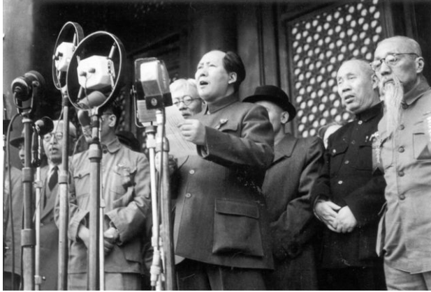
Mao and Chinese leaders at Tiananmen, October 1, 1949

The PRC, in capping a century of rebellion, revolution, and civil and international wars, assumed an epochal role in redefining China's territoriality. Although the GMD regime's relocation to Taiwan complicated the task, founders of the PRC would proceed to establish effective control over the late Qing's imperial domain minus independent Mongolia. In the process they made a most important alteration of China's administrative system in order to accommodate Inner Mongol aspirations. Earlier, in 1935, CCP rhetoric on abolition of the Chinese provincial system in Inner Mongolia and on return of all Inner Mongolian territories to the Inner Mongols was closely associated with the party's agitation for the Inner Mongols' "independence" from GMD despotism. This was an attempt by the CCP to win Inner Mongols support in the Chinese civil war, not an ironclad guarantee that Inner Mongols would maintain "regional autonomy" within a CCP-dominated China in the future. When the CCP resumed its