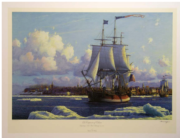
The Empress of China sails

After 1931 Washington's moralistic and legalistic stand against Japanese occupation of Manchuria was certainly helpful in buttressing Chinese morale. During World War II the Roosevelt administration aided China in restoring its great power status. This not only led to the end of the "unequal treaties" between China and Western powers but also promised China recovery of its "lost territories" from Japan. Roosevelt's stumbling on the Mongolia question and his concession to Stalin's Manchurian ambitions at Yalta, however, were not appreciated by Chinese of any political persuasion. After Yalta, Moscow's Mongolian satellite and Manchurian sphere seemed to bear an American stamp.