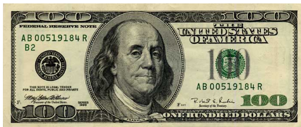
US 100 dollar supernote