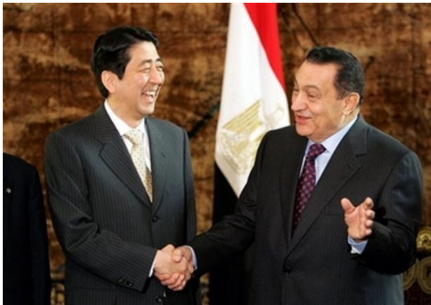
Abe and Pres. Mubarak

In their separate joint statements with Abe, most of the Middle East leaders, including Egyptian President Hosni Mubarak, expressed their appreciation for Japan's "contributions for the reconstruction and stability of Iraq". Some of the statements specifically cite either Japan's provision of economic aid or its sponsoring of a seminar on national reconciliation, attended by influential Iraqi figures, in Tokyo in March. But no statement directly referred to Japan's dispatch of SDF troops.