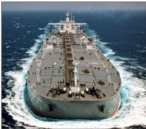
Japanese-operated oil tanker Bright Artemis

Japan imports almost all of its oil, and is the world's third-largest oil consumer after the US and China. Japan relies on the Middle East for nearly 90% of its oil. The six nations of the Gulf Cooperation Council (GCC) - Saudi Arabia, the UAE, Kuwait, Qatar, Oman and Bahrain - alone supply about 75% of Japan's oil.