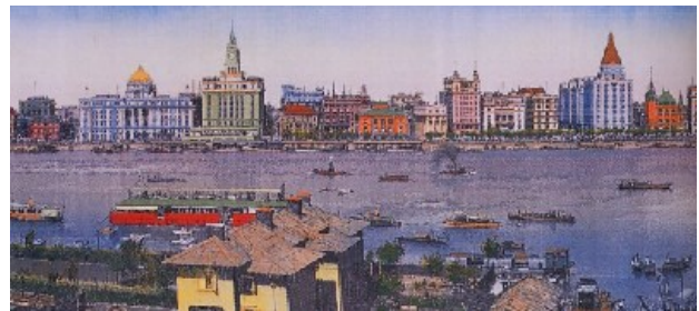
The Bund in Shanghai in the 1920s

Shanghai was, to start, a meeting place for international Communists. Japanese radicals met up with Comintern representatives there in an effort to found and then maintain the Japanese Communist Party in the early 1920s, and they received significant financial support from those visits. [8] Shanghai was the gateway for Japanese radicals seeking to study in Russia. [9] Shanghai was the site of the formation of the Chinese Communist Party in 1921. It was a burgeoning industrial city of immigrants rife with labor and national problems. S. A. Smith writes, “In this city of 2,700,000 people, there were up to 800,000 working people, including 250,000 factory workers... By March 1927 it [the Communist-led Shanghai General Labour Union] claimed that 502 labour unions, with 821,280 members, were affiliated to it.” [10]