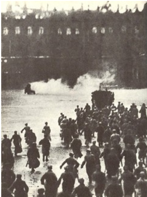
Image from the Bolshevik Revolution, 1917

Labor uprisings throughout East Asia, anti-colonial movements in Korea and semicolonial China, and the Bolshevik Revolution in Asia's neighboring country brought revolution to the horizon of the thinkable in East Asia.