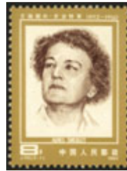
Agnes Smedley (Chinese postage stamp)

how "new techniques were highlighted in the flashback scene in the production of The Overman where they combined stage dialogue with film projection." [14] Moreover, the productions of the Shanghai Art Drama Society attracted an audience of international progressives such as "American reporter Agnes Smedley and Japanese reporter Ozaki Hotsumi," each of whom would impinge significantly on the Chinese revolution. [15]