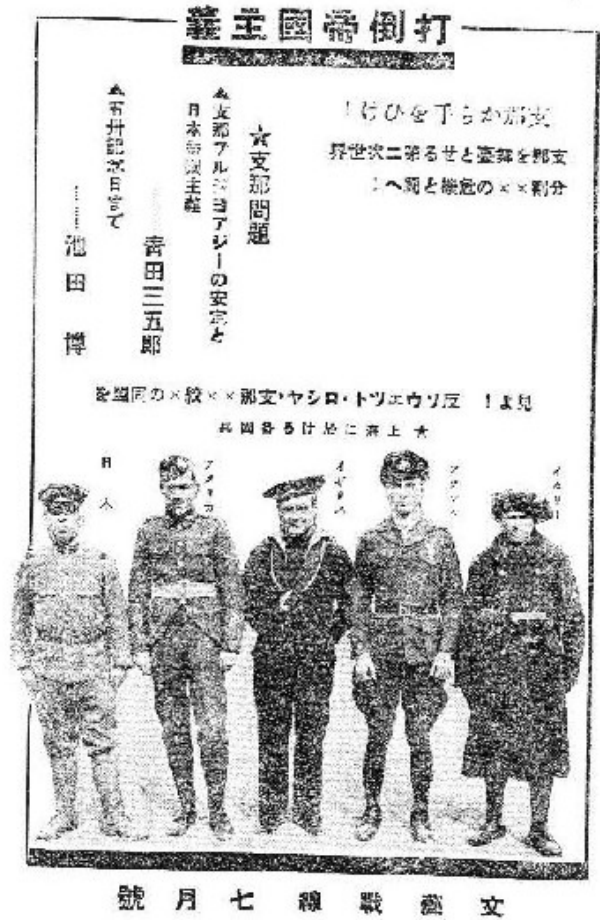
Photo collage from Bungei sensen showing five imperialist nations vying for control of China: Japan, American, England, France and Italy. Headlines read, “Get your hands off China!” and “The stage will be set for WWII in China.” The Chinese header reads “Down With Imperialism.” (July 1929)

Two of the three initiatives outlined by Denning are grounded in antiwar and anticolonialist projects. The class-based, internationalist energies of the Clartè , Baku and Soviet proletcult movements were developed into study groups, publications, theater guilds and arts movements throughout the world, including Japan, Germany, Hungary, Poland, Austria, Korea, China and the United States. [6] Denning writes, “The ‘imaginative proximity of social revolution’ electrified a generation of young writers who came together in a variety of revolutionary and proletarian writers’ groups.” [7]