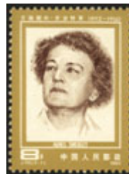
Agnes Smedley (Chinese postage stamp)

how "new techniques were highlighted in the flashback scene in the production of The Overman where they combined stage dialogue with film projection." [14] Moreover, the productions of the Shanghai Art Drama Society attracted an audience of international progressives such as "American reporter Agnes Smedley and Japanese reporter Ozaki Hotsumi," each of whom would impinge significantly on the Chinese revolution. [15]