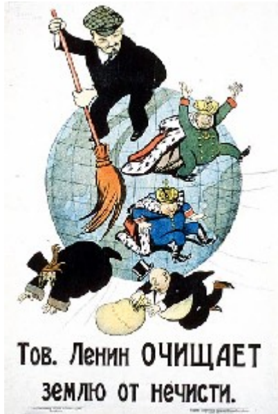
Depiction of Lenin sweeping the globe

Two of the three initiatives outlined by Denning are grounded in antiwar and anticolonialist projects. The class-based, internationalist energies of the Clartè , Baku and Soviet proletcult movements were developed into study groups, publications, theater guilds and arts movements throughout the world, including Japan, Germany, Hungary, Poland, Austria, Korea, China and the United States. [6] Denning writes, “The ‘imaginative proximity of social revolution’ electrified a generation of young writers who came together in a variety of revolutionary and proletarian writers’ groups.” [7]