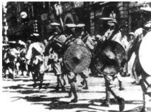
National Revolutionary Army forces enter the British Concession, Hubei, 1927.