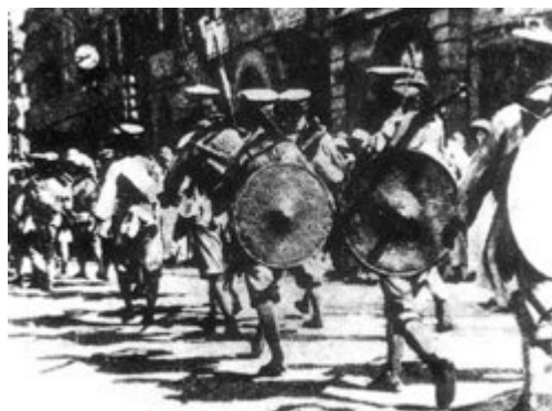
National Revolutionary Army forces enter the British Concession, Hubei, 1927.