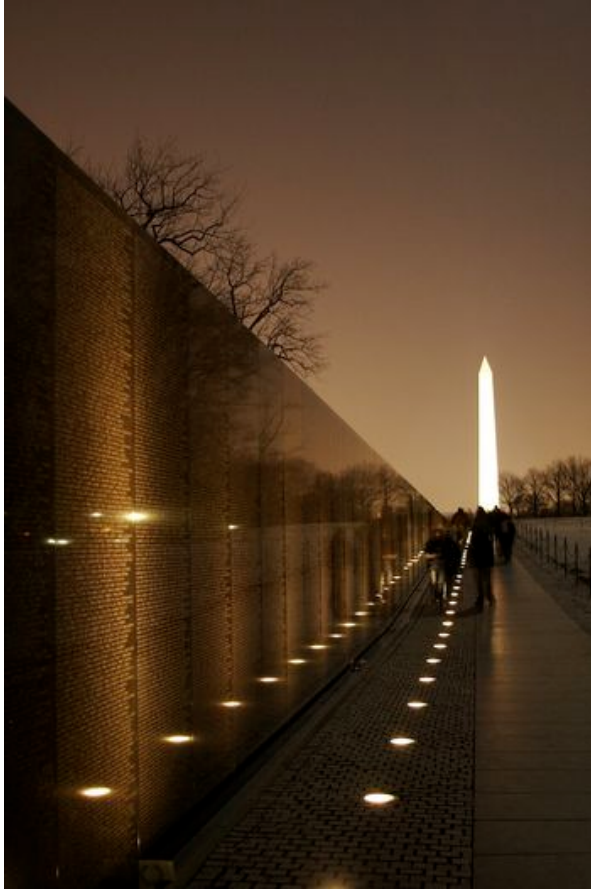
The Vietnam Veterans Memorial with the Washington Monument in the background in Washington, DC.

The list of U.S. names, of course, points to an abstraction, a theoretical equality denied a disproportionately large number of U.S. servicemen and women in life, but which they always achieve in their deaths: these names are not marked by race or class, only by the understanding that they are “American.” The writing of these names upon this wall of death, then, produces an “inside,” a “shared sense” of national mourning only by erasing the