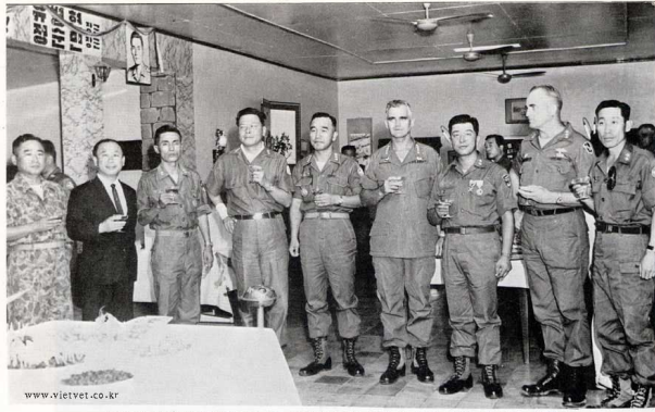
Korean Commanders of “Tiger Division” at a party with American officers, including US Commanding General William Westmoreland (4th right), September 20,1967. The Division experienced extensive combat during both the Korean and Vietnam Wars.