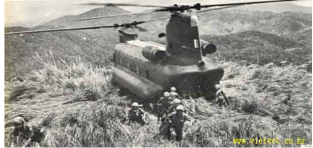
ROK forces in action in Vietnam

alienation and possibility: the desire he indicates at the close of the text to leave Vietnam, to never see anyone he met there again, can itself be read as desire to move beyond the narrative that has produced him, to abandon the register of the detective novel (the genre associated with the securing of the bourgeois home by the detective-genius). Yong-gyu cannot locate a position in which to act meaningfully in Vietnam—he never considers crossing over to the NLF. Vietnam becomes a location both abundant in meaning (the socialist realist narrative which the reader can learn from, but which Yong-gyu does not enter) and, on one level, meaningless (the detective novel which, while allowing the gaining of certain forms of knowledge, precludes Yong-gyu from revolutionary activity). We should note that the “father,” sign of consciousness, appears in both genres, making use of one location (the black market) for the benefit of the other (the revolutionary cause). Nguyen Thach is more than an actor in both narratives: his ability to read the black market, the detective novel, in socialist realist, revolutionary terms marks him as a master of genres. It is through the figure of Nguyen Thach that the socialist realist narrative becomes a mode of reading rather than writing, a frame to comprehend the black market/detective novel.