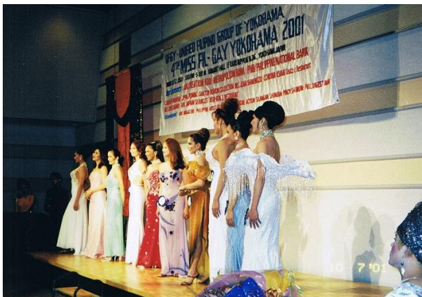
Figure 3: Filipino Hostess and Host Club Workers Participating in a "Miss Fil-Gay" (Filipino Gay) Beauty Pageant