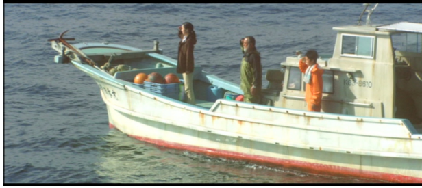
Figure 3: Scene from Otokotachi no Yamato (2005, Dir. Sato) in which three generations unite in saluting the fallen dead of World War II

But how effective is the graphic portrayal of the Yamato's demise as an argument for Japanese patriotism? Hannya's song, which explicitly invokes the film (e.g., using the same digital image of the battleship for the cover of his single) suggests that the lessons can in fact run counter to the kinds of interpretations that Ishihara and other nationalists would expect.