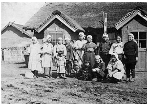
Japanese settlers from Saitama Prefecture

We young Japanese at the time were burning with passion to establish an ideal state on Manchurian terrain in which there would be ethnic harmony, and thus we hurried off to Manzhouguo. We poured our hearts and souls into building such a state.... As history moved forward, the ideal of ethnic harmony would have gradually increased in radiance. Without this, I believe that perpetual peace in the world is impossible to attain. In this sense, then, the ideals of building that state of Manzhouguo will live on forever. [10]