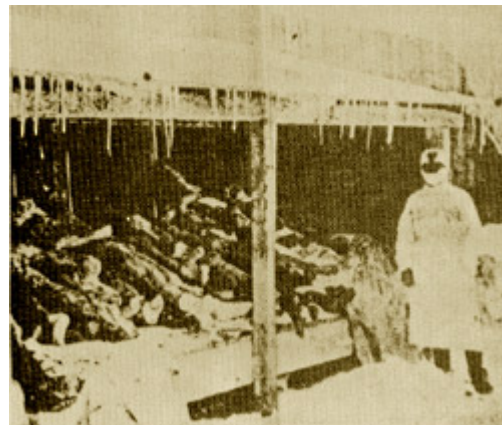
Body disposal at Unit 731

Changchun, or the Northeast China Martyrs Museum and the Museum of the Evidence of the Crimes of Unit 731 of the Japanese Army of Aggression in Harbin, or the Hall of the Remains of the Martyred Comrades at Pingdingshan in Fushun, comfortable images will no longer be acceptable.