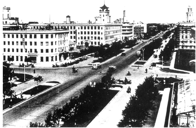
Hsinking avenue in Hsinking, the capital of Manchouguo, subsequently renamed Changchun.

ceased to exist, for the people who continue to live there, and for the dwindling number of survivors of that era, the wounds of Manchouguo continue to ache and will not heal or disappear.