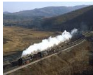
Hunjiang-Tonghua Railway. Manzhouguo

Must we heed the view repeatedly put forward that one should rightfully look not only at the aspect of the Japanese invasion of the mainland leading to the creation of Manzhouguo but also at the aspect of its accomplishments? In other words, it has been emphasized that despite its short history a “legacy of Manzhouguo” has contributed greatly to the modernization of China’s Northeast in such areas as the development and promotion of industry, the spread of education, the advancement of communications, and administrative maintenance. These attainments, the argument continues, cannot only withstand scrutiny from our perspective today—when ethnic harmony has become an important ideal in politics—but they also warrant significance as an “experiment for the future”—namely, what may be possible in the arena of cooperation among different ethnic groups in years to come. Can this argument be justified?