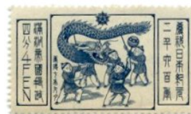
Anniversary stamps of Manzhouguo

Kishi Nobusuke (1896-1987), who worked as deputy director of the Management and Coordination Agency of Manzhouguo and became prime minister of Japan after the war, has also noted in a memoir that, in the