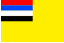
Flag of Manchouguo

For the great majority of Japanese who have since lived through more than a half-century longer than the thirteen and one-half years that Manchouguo existed, that land has become little more than a historical term which conjures up no particular image of any sort. To be sure, the past half-century has been sufficiently long for many matters to pass from experience to memory and from memory into history, long enough perhaps for even the experience of hardship to be refined into a form of homesickness, for the crimes that transpired all around them to be forgotten as if the whole thing had been a daydream. For the Japanese in the home islands with no links to Manchouguo, whether they have sunk into oblivion or, pent up with their memories, have taken their ignorance of Manchouguo as commonsensical, today the scars left from Manchouguo continue to live on in that land, be it as the issue of war orphans “left behind” in China or as that of the wives left behind. Although Manchouguo has