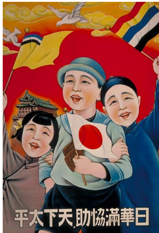
Propaganda poster hails Japan, China, Manchu cooperation

struggled for their ideals remains the pride of Japanese youth.” [3] Without the least doubt, he believed that the ideal of ethnic harmony—the founding ideal of the state of Manzhouguo—would continue to shine brilliantly for many years.