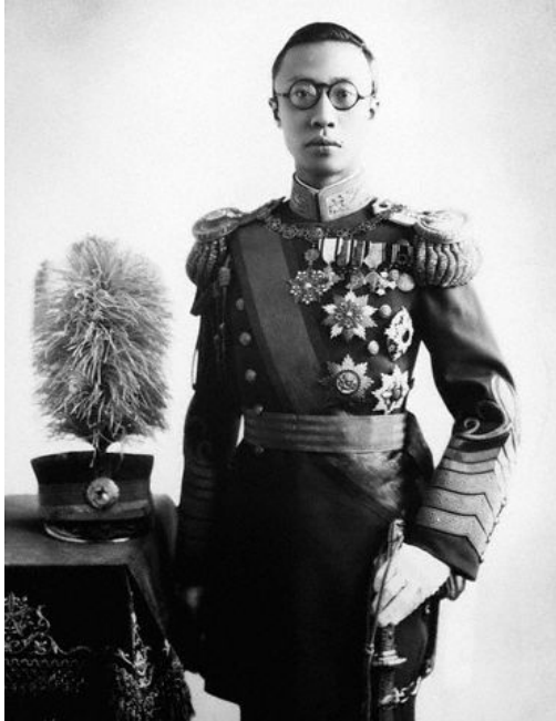
Puyi as the Kangde Emperor of Manchouguo

In Chinese history texts and dictionaries, by contrast, Manchouguo is described in the following manner: a puppet regime fabricated by Japanese imperialism after the armed invasion of the Three Eastern Provinces (also known as Manchuria or Northeast China); with the Japan-Manchouguo Protocol, Japanese imperialism manipulated all political, economic, military, and cultural powers in China's northeast; in 1945 it was crushed with the Chinese people's victory in the anti-Japanese resistance. In order to highlight its puppet nature and its anti-popular qualities, the Chinese refer to it as "wei Manchouguo" (illegitimate or puppet Manchouguo) or "wei Man" for short.