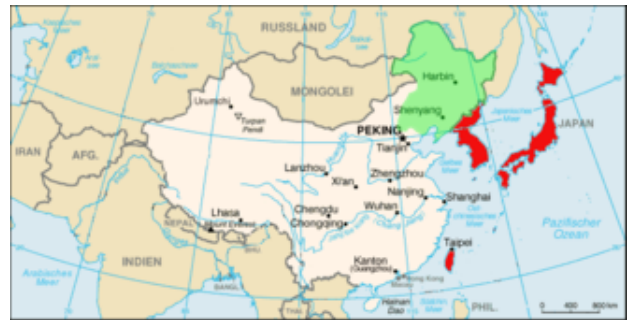
Manzhouguo shown in green