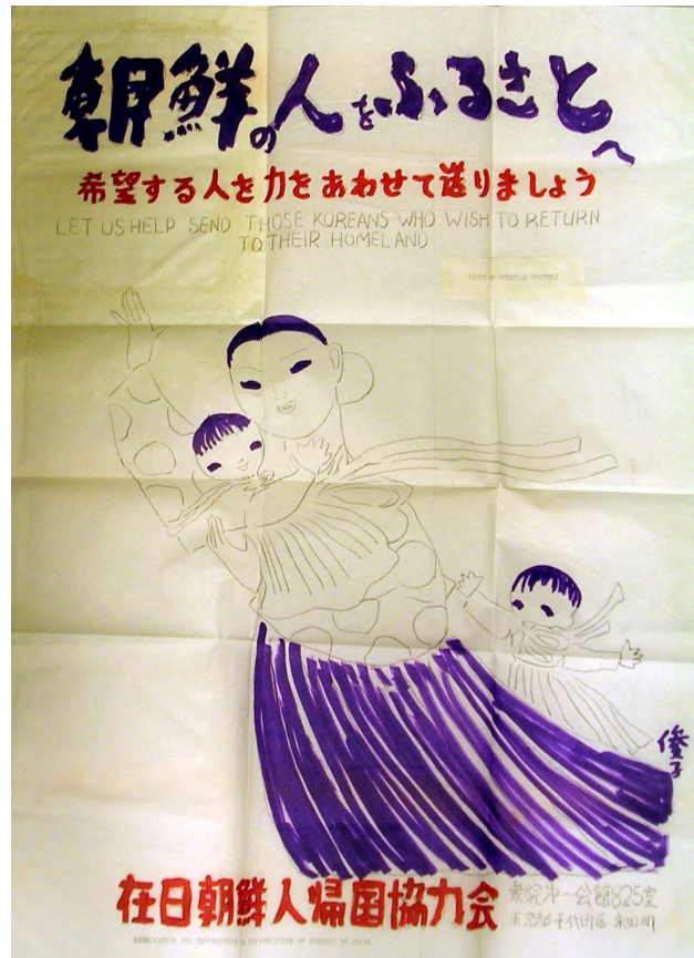
Copy of a Repatriation Cooperation Society Recruitment Poster

was set up to distribute information encouraging Koreans to "return" to North Korea. Leading members included former Prime Minister Hatoyama Ichiro and prominent ruling-party politician Koizumi Junya (whose son Koizumi Junichiro was to become Prime Minister in 2001).