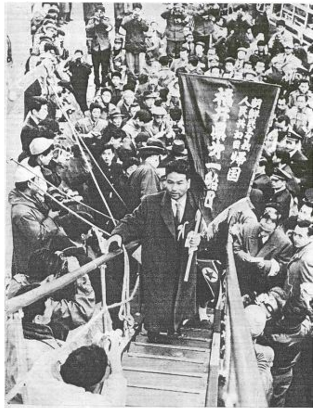
"To our dear fatherland!" The first one comes up the gangway

regime, those who "returned" to North Korea included tens of thousands of people whose only dream was a better future for themselves and their families: people who included entrepreneurs, technicians and university lecturers as well as the poor and unemployed. While most were ethnic Koreans, their number also included over 6,000 Japanese nationals (mostly spouses of Korean men). Many thousands, of course, were children.