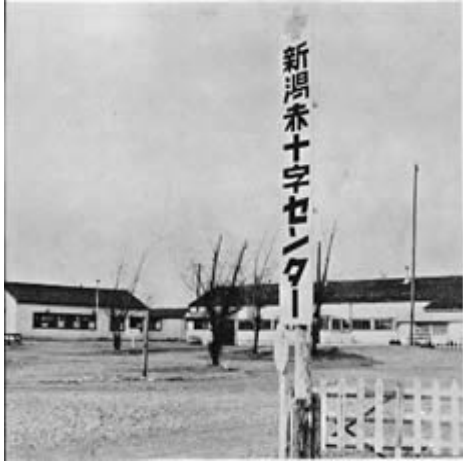
Japan Red Cross Center in Niigata

At first, the North Korean response to the proposal was cool. It was happy to accept a small number of "true believers", but it was having enough problems feeding its own people in the wake of the Korean-US War without accepting a mass inflow of immigrants. In 1958, however, North Korean leader Kim Il Sung dramatically changed course. Apparently seeing the scheme as a valuable source of skilled labor, and as an international propaganda coup which might damage Japan's relations with South Korea and the US, he issued a public welcome to ethnic Koreans from Japan, promising them housing, jobs, education and welfare.