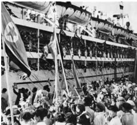
North Koreans at Cheongjin welcome the repatriates

Testimony from the small number of former "returnees" who have recently slipped across the border out of North Korea recalls the shock they felt on first arriving and realising the desperate poverty of the country to which they had come. Their plight was made worse some years after the start of the "repatriation", when the North Korean government began to regard "returnees" from Japan with growing suspicion and prejudice. Thousands were sent to labour camps. Of these, many were never heard from again.