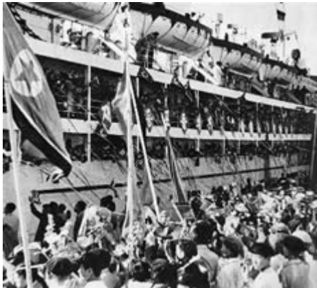
North Koreans at Cheongjin welcome the repatriates

Testimony from the small number of former "returnees" who have recently slipped across the border out of North Korea recalls the shock they felt on first arriving and realising the desperate poverty of the country to which they had come. Their plight was made worse some years after the start of the "repatriation", when the North Korean government began to regard "returnees" from Japan with growing suspicion and prejudice. Thousands were sent to labour camps. Of these, many were never heard from again.