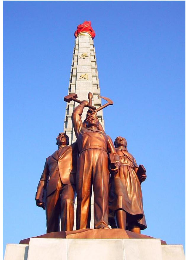
Korean monument to Sure Victory

Watching China's independent nuclear development, from the 1960s North Korea was interested in nuclear development, and in the context of its adoption of Juche Ideology and its aim at a "unique ideological system," "a Suryong (leader) system," and a "partisan state," the idea of nuclear weapons as the pillar of autonomous defense came easily. However, even though there may have been such an idea, and research may have begun, the path to success in nuclear development must have seemed remote.