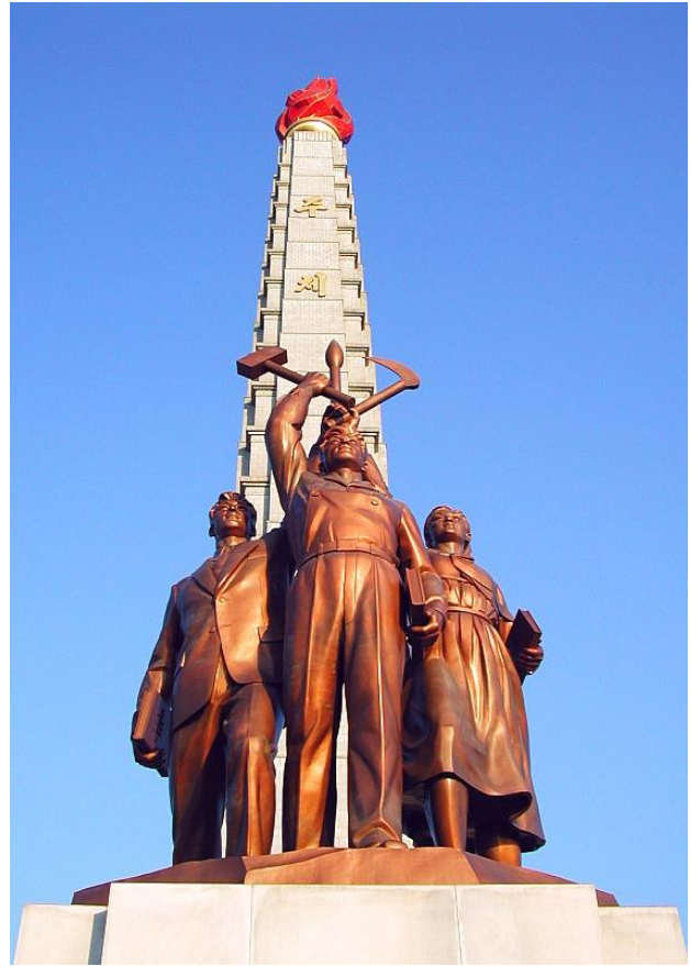
Korean monument to Sure Victory

Watching China's independent nuclear development, from the 1960s North Korea was interested in nuclear development, and in the context of its adoption of Juche Ideology and its aim at a "unique ideological system," "a Suryong (leader) system," and a "partisan state," the idea of nuclear weapons as the pillar of autonomous defense came easily. However, even though there may have been such an idea, and research may have begun, the path to success in nuclear development must have seemed remote.