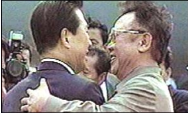
Kim Dae Jung and Kim Jong Il at 2000 summit in Pyongyang

With the victory of the Republican candidate, George W. Bush, in the presidential election, the situation took a sudden turn for the worse. Bush showed personal hostility towards Kim Jong Il, and referred to North Korea as a member of the “Axis of Evil.” After 9/11 he went to war in Afghanistan and in Iraq. North Korea began to look for ways to pursue nuclear weapons development outside of the Agreed Framework which was in shambles.